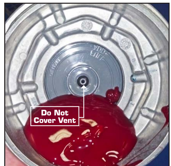
Figure 2: Fill Level for Semi-fluid Grease