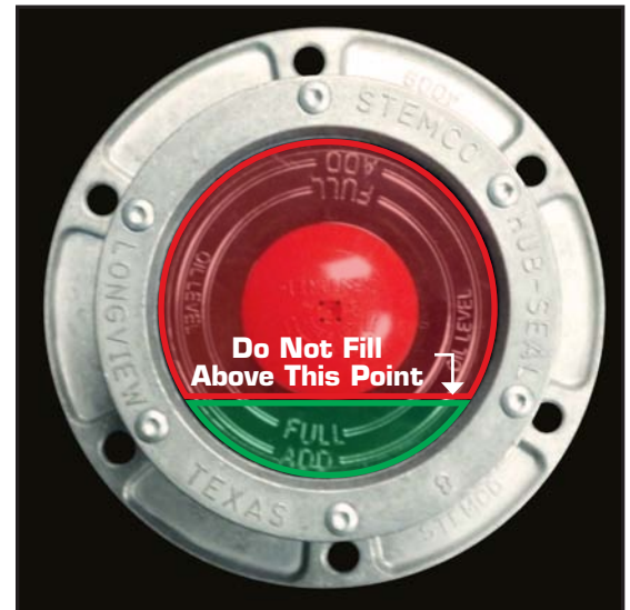
Figure 1: Fill Level for Oil