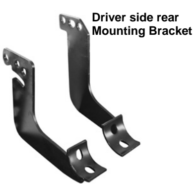
Driver side front Mounting Bracket