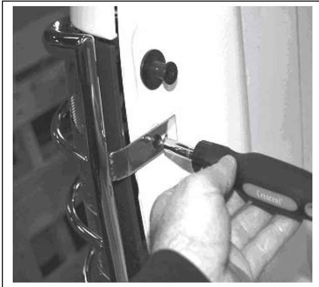
FIG. 3 Stock taillight mounting screws reinstall through inside brackets.