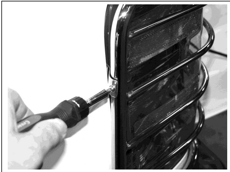
FIG. 4 4mm screw installs through front bracket into threaded insert in guard