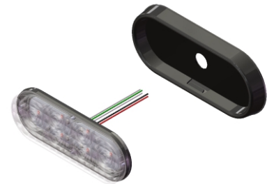
Flush Mount Bezel