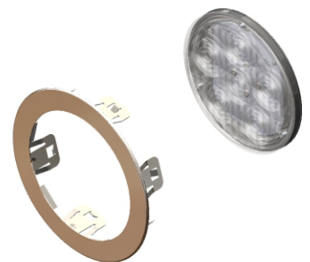
Recessed Chrome Ring