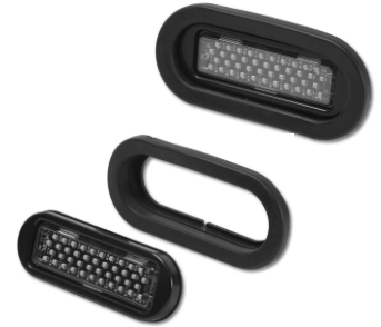
Oval Bezel easily fits standard 6" rubber grommets. (grommets not included, order part # 527)