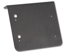
274-DLXT-2X1 L-Bracket for Mounting Two Single Bezel Series LED Lights Vertically