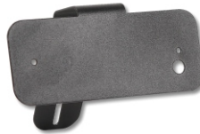
274-DLXT-T Bracket for Trunk Mounting