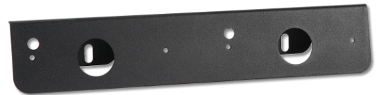
274-DLXT-RL Bracket for License Plate Mounting