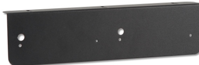
274-DLXT-1X2 L-Bracket for Mounting Two Single Bezel Series LED Lights Horizontally