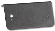
274-DLXT-U L-Bracket for Universal Mounting