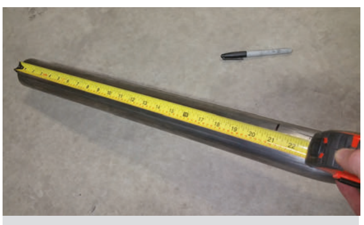
2 Doors Only