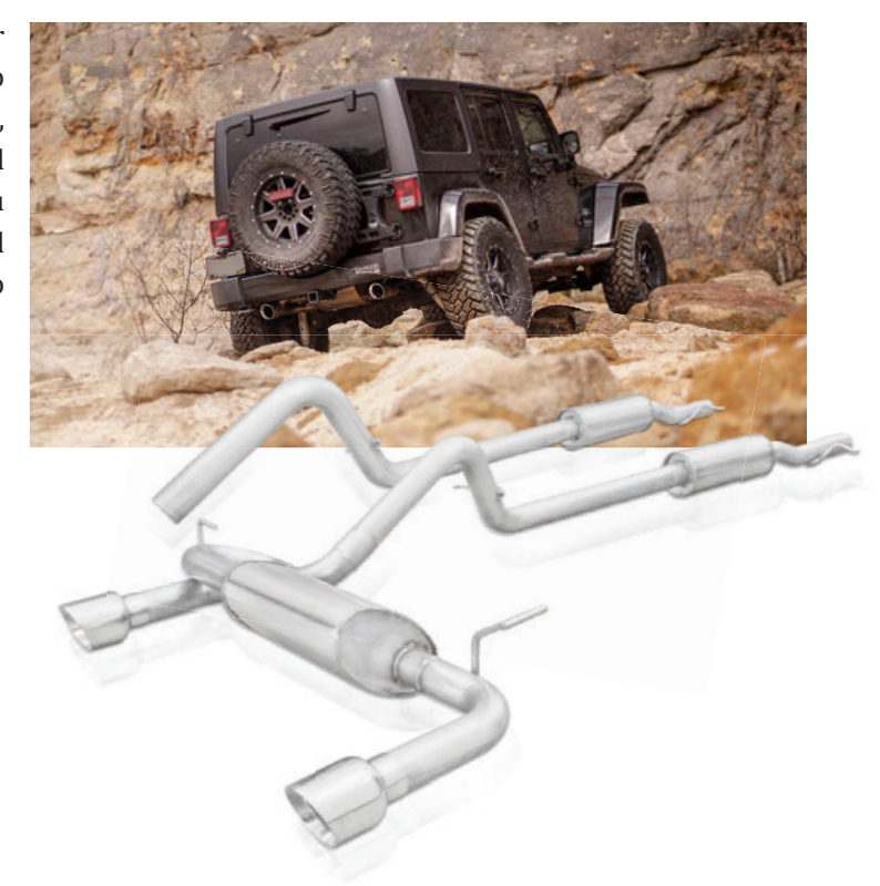
Jeep Wrangler JK/JKU 3.8L/3.6L For Part #s JPJKUCB, JPJKUCBD, JPJKAB

When installing your catback bumper exit system, make certain that the hangers at the end of the exhaust have at least 3/4" of clearance to the bumper. The exhaust will grow over 1/2" in length and can possibly damage the bumper. If the end of the hangers are too close to the bumper, then you must make sure that you have everything pushed forward onto the slip fit joints more fully.