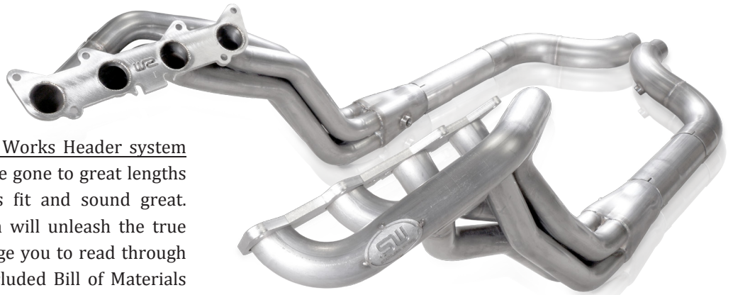
Shelby GT350 Headers

Thank you for purchasing a Stainless Works Header system for your 2015+ Shelby GT350. We have gone to great lengths to be sure that our exhaust systems fit and sound great. We are proud to say that this system will unleash the true character of your vehicle. We encourage you to read through the following steps, and check the included Bill of Materials before beginning installation. Please follow these steps to ensure that your installation goes as planned.