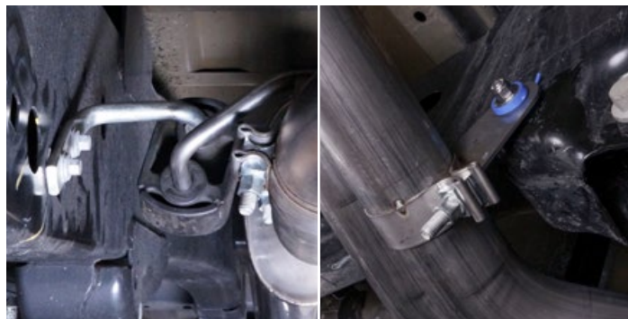
Detail 6 & 10 - Hanger Examples

After double checking for clearance and making sure all lines, wires and hoses are secured, drive the car for 10-20 miles and re-check all clamps and clearances. Your system may be tack welded at the joints/ clamps to reduce shifting of the system during heating and cooling cycles. Make certain to disconnect the battery before performing any welding.