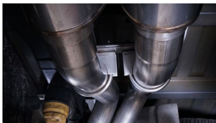
Detail 8 - Tailpipe Hanger