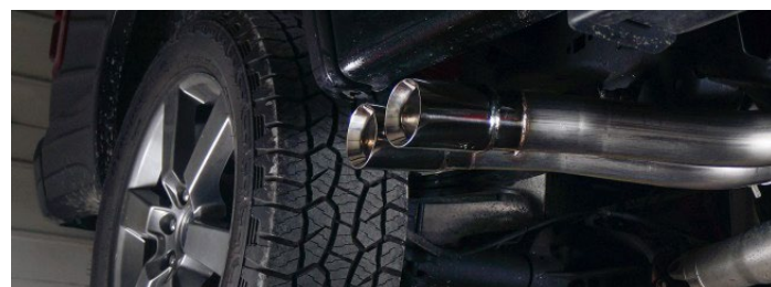
Lightning Side-Exit Exhaust