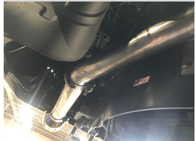
Detail 12: Rear tail section and tip installed.