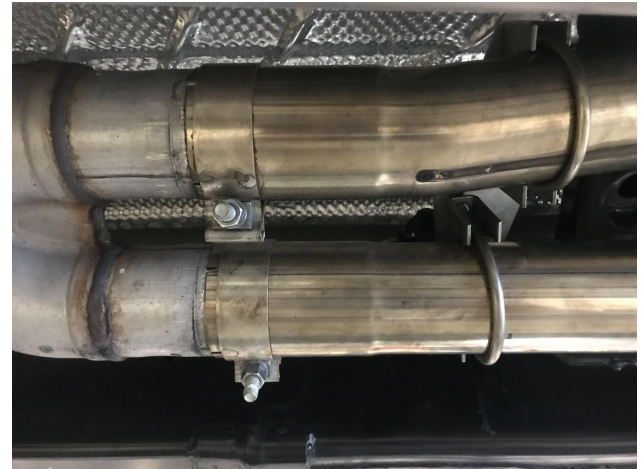
Detail 10: Muffler inlet pipes & u-bolt clamps attached to front hanger assembly.

17. After double checking for clearance and making sure all lines, wires and hoses are secured, drive the truck for 10-20 miles and re-check all clamps and clearances. Your system may be tack welded at the joints/ clamps to reduce shifting of the system during heating and cooling cycles. Make certain to disconnect the battery before performing any welding.