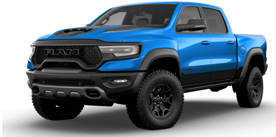
2021+ Ram TRX 1500 (RAM21CBRBC) (RAM21CBLBC)

Thanks for purchasing a Stainless Works catback exhaust system for your 2021+ Ram TRX 1500. Our team has worked to ensure that this product is the premium in performance, quality, and fitment. We are proud to say that this system will unleash the true character of your vehicle. We encourage you to read through the following steps, and check the included Bill of Materials before beginning. Please follow these steps to ensure that your installation goes as planned.