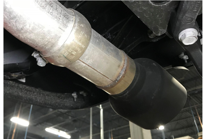
Detail 3: OEM tip connection