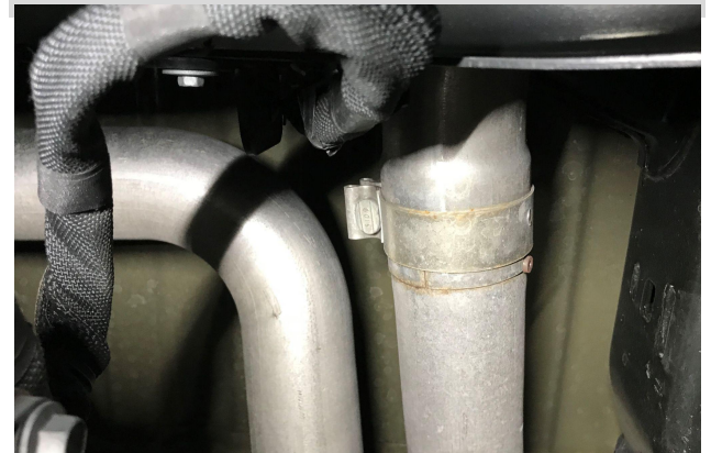
Detail 5: Passenger side OEM rear tailpipe clamp connection