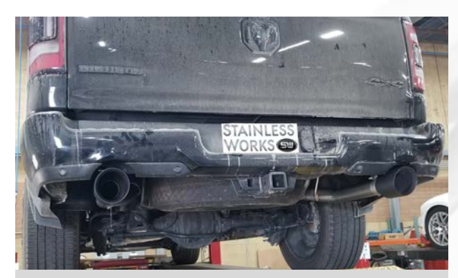
Detail 13: System installed. View from rear of vehicle.