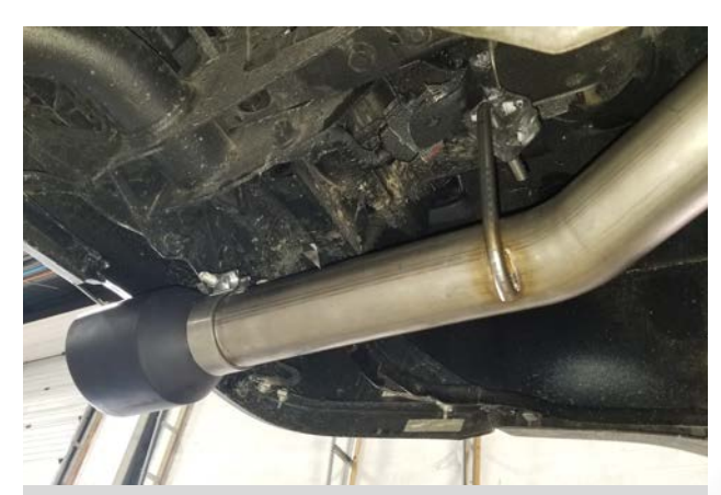
Detail 12: Rear tail section and tip installed.