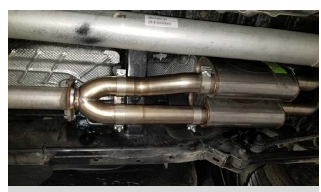
Detail 7: Factory Y-pipe connection shown