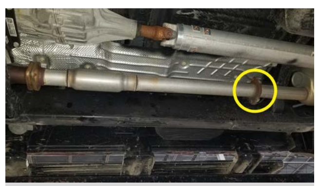
Detail 3: Rear OEM flange connection

CATBACK INSTALLATION INSTRUCTIONS PAGE 2