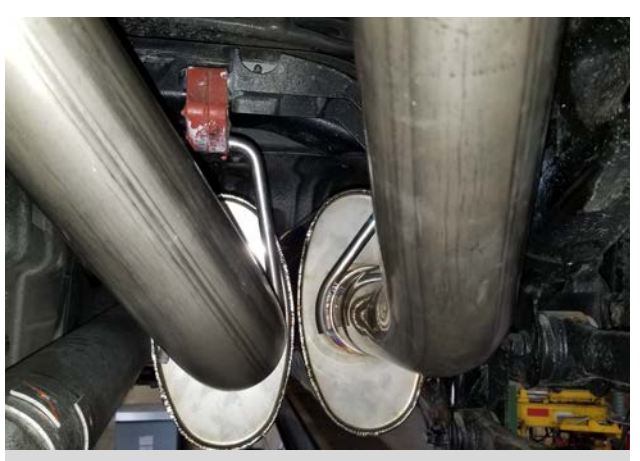
Detail 12: Orientation of hanger assemblies behind mufflers.

CATBACK INSTALLATION INSTRUCTIONS PAGE 3