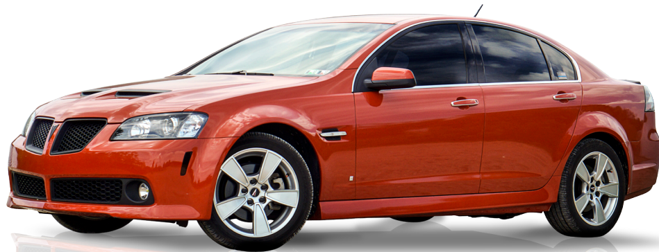
G8 Exhaust Systems (PG8CB, PG8CBFC)

Thanks for purchasing a Stainless Works catback system for your 2008-2009 Pontiac G8 6.0L. Our team has worked tirelessly to ensure that this product is the premium in performance, quality, and fitment. We are proud to say that this system will unleash the true character of your vehicle. We encourage you to read through the following steps, and check the included Bill of Materials before beginning. Please follow these steps to ensure that your installation goes as planned.