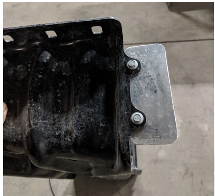
Detail 23: Remove the small silver shield

23. Before installing the transmission crossmember, remove the small shield from it - (2) 6mm bolts and nuts.