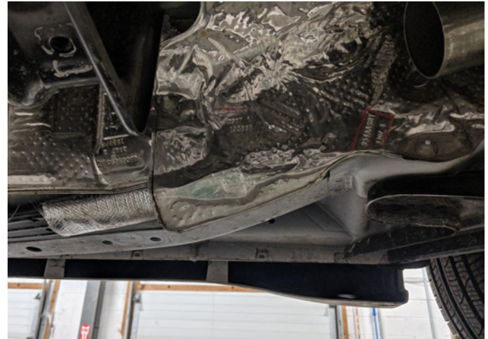
Detail 24: Left side heat shield

After double checking for clearance and making sure all lines, wires, and hoses are secured, drive the car for 10-20 miles and re-check all clamps and clearances. Your system may be tack welded at the joints/clamps to reduce shifting of the system during heating and cooling cycles. Make sure to disconnect the battery before performing any welding.