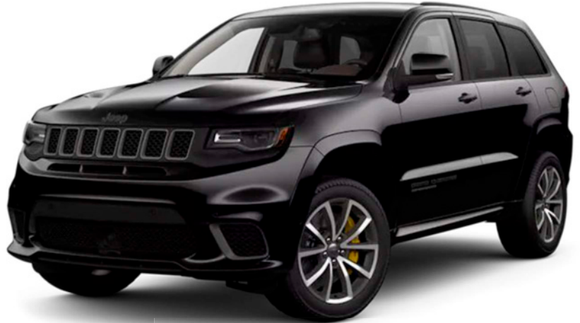
2018+ Jeep Grand Cherokee Trackhawk 6.2L (JEEP1862HCAT, JEEP1862HOR)

Thanks for purchasing a Stainless Works header system for your 2018+ Jeep Grand Cherokee Trackhawk 6.2L. Our team has worked to ensure that this product is the premium in performance, quality, and fitment. We are proud to say that this system will unleash the true character of your vehicle. We encourage you to read through the following steps, and check the included Bill of Materials before beginning. Please follow these steps to ensure that your installation goes as planned.