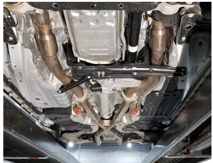
Detail 28: Connection to catback Stainless Works catback shown