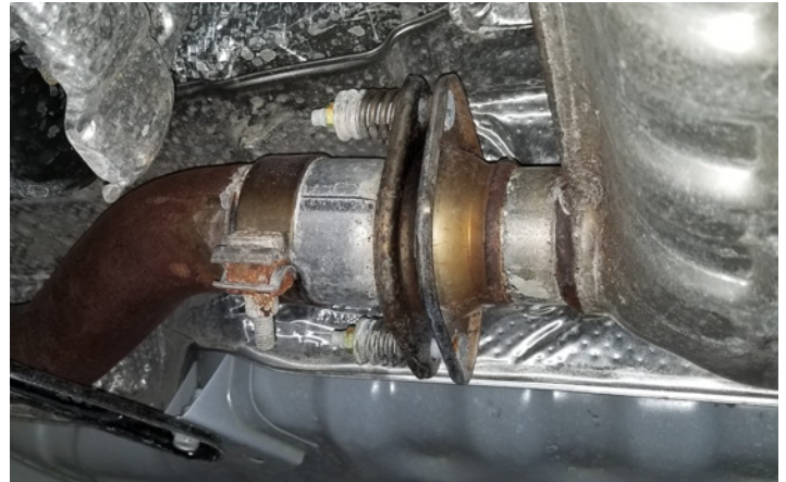
Detail 7: Flanged catback connection