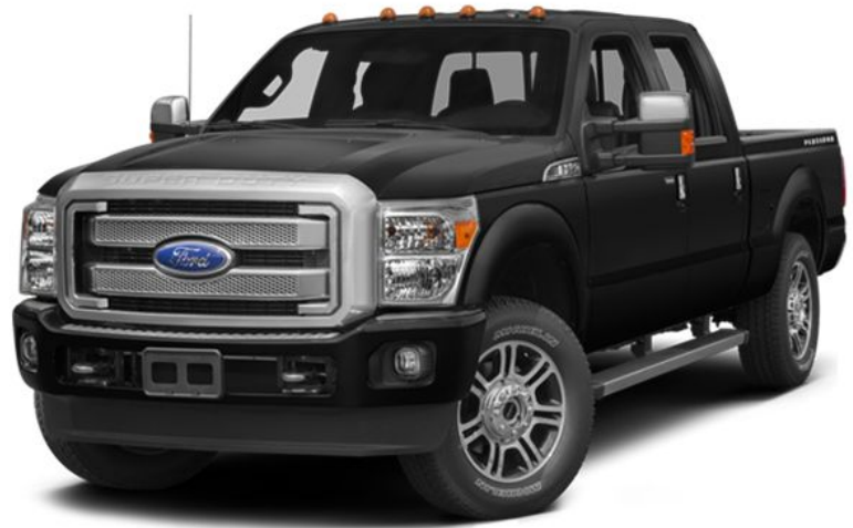
2011-16 F250 6.2L (FT2CB)

Thanks for purchasing a quality Stainless Works catback exhaust system for your 2011-16 Ford F250 6.2L. Our team has worked to ensure that this product is the premium in performance, quality, and fitment. We are proud to say that this system will unleash the true character of your vehicle. We encourage you to read through the following steps, and check the included Bill of Materials before beginning. Please follow these steps to ensure that your installation goes as planned.