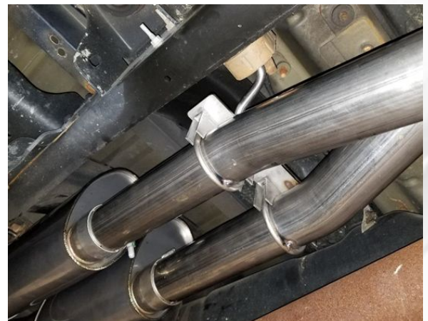
Detail 12: Inlet pipes to mufflers