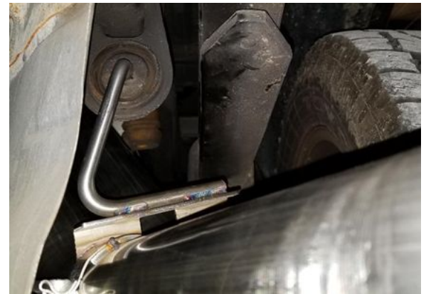
Detail 14: View from rear of vehicle