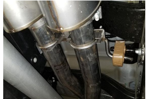
Detail 13: Inlet pipes to mufflers

20. After double checking for clearance and making sure all lines, wires and hoses are secured, drive the truck for 10-20 miles and re-check all clamps and clearances. Your system may be tack welded at the joints/ clamps to reduce shifting of the system during heating and cooling cycles. Make certain to disconnect the battery before performing any welding.