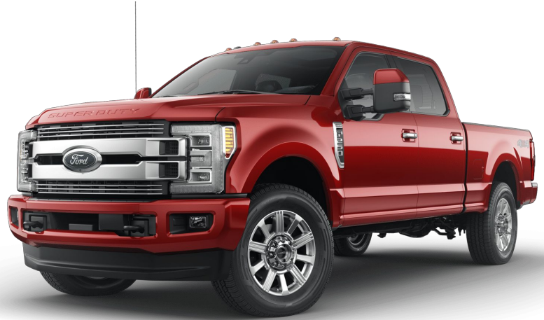
2017+ F250 6.2L (FT217CB)

Thanks for purchasing a Stainless Works catback exhaust system for your 2017+ Ford F250 6.2L. Our team has worked to ensure that this product is the premium in performance, quality, and fitment. We are proud to say that this system will unleash the true character of your vehicle. We encourage you to read through the following steps, and check the included Bill of Materials before beginning. Please follow these steps to ensure that your installation goes as planned.