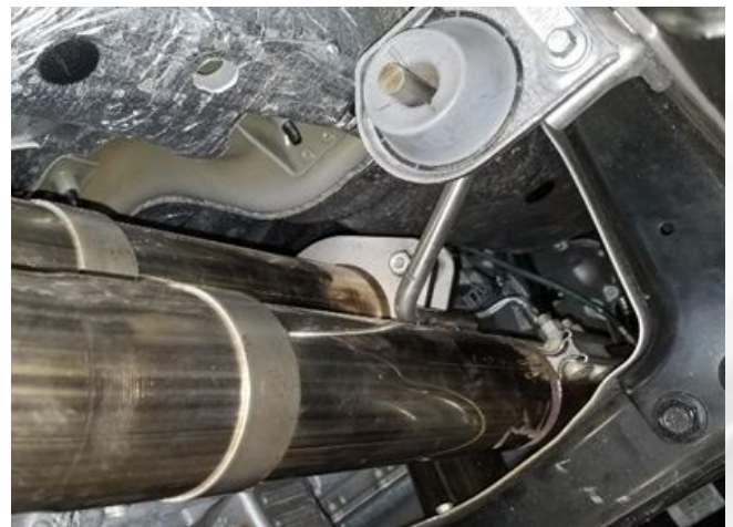
Detail 10: Inlet connection and X-pipe installed