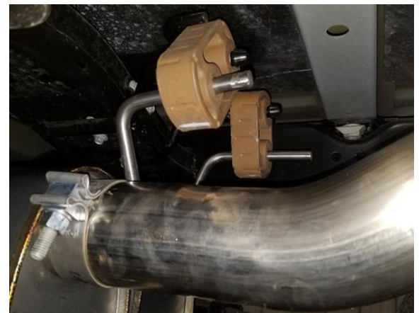
Detail 14: Muffler to tailpipe connection