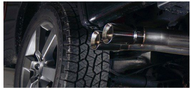
Detail 10a: Lightning Side-Exit Exhaust