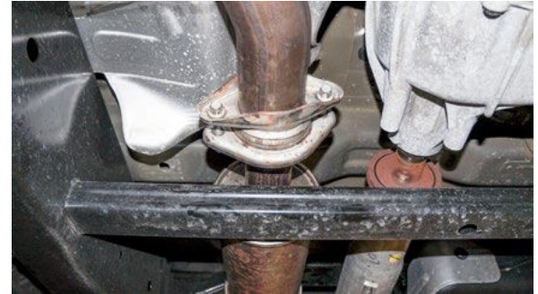
Detail 3: OEM flanged connection point