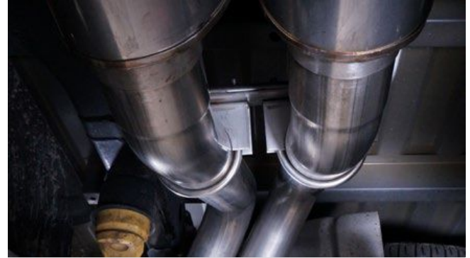
Detail 9: Front tailpipe hanger

13. After double checking for clearance and making sure all lines, wires and hoses are secured, drive the truck for 10-20 miles and re-check all clamps and clearances. Your system may be tack welded at the joints/ clamps to reduce shifting of the system during heating and cooling cycles. Make certain to disconnect the battery before performing any welding.