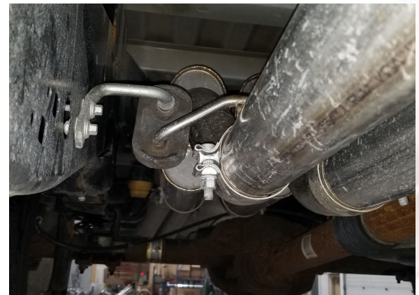
Detail 7: Orientation of front hanger assembly