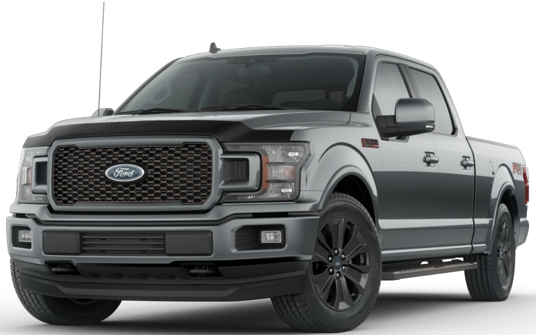
2015+ Ford F-150 (FT15CB, FT18CB)

Thanks for purchasing a Stainless Works catback exhaust system for your 2015+ Ford F-150. Our team has worked to ensure that this product is the premium in performance, quality, and fitment. We are proud to say that this system will unleash the true character of your vehicle. We encourage you to read through the following steps, and check the included Bill of Materials before beginning. Please follow these steps to ensure that your installation goes as planned.