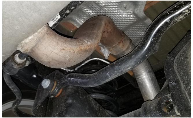
Detail 3: OEM axleback connection