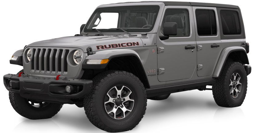
2018+ Jeep Wrangler JL/JLU 3.6L (JPJLAB, JPJLUCB, JPJLUCBD)

Thanks for purchasing a Stainless Works exhaust system for your 2018+ Jeep Wrangler JL/JLU 3.6L. Our team has worked to ensure that this product is the premium in performance, quality, and fitment. We are proud to say that this system will unleash the true character of your vehicle. We encourage you to read through the following steps, and check the included Bill of Materials before beginning. Please follow these steps to ensure that your installation goes as planned.