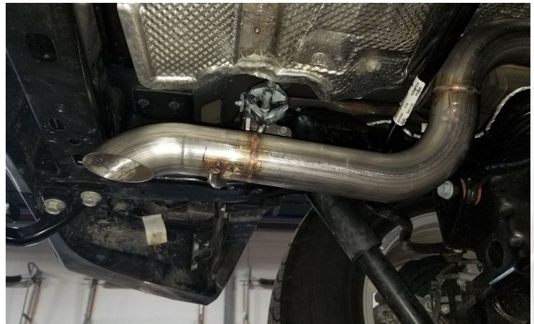
Detail 15b: Dump tip installed