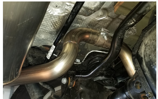
Detail 12: Muffler connection.