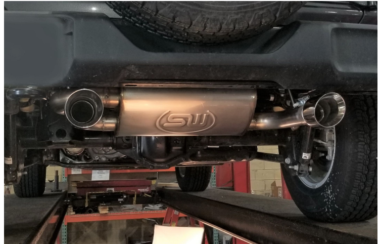
Detail 15a: Muffler and tips installed