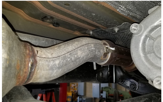
Detail 7: OEM catback connection