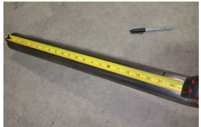
Detail 10a: 2 Doors only. Mark and cut 21" from mid pipe inlet.