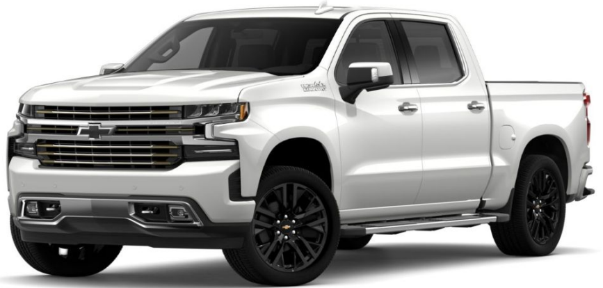
2019+ Silverado / Sierra (CT19H)

Thanks for purchasing a Stainless Works Header system for your 2019+ Chevy Silverado / GMC Sierra. Our team has worked to ensure that this product is the premium in performance, quality, and fitment. We are proud to say that this system will unleash the true character of your vehicle. We encourage you to read through the following steps, and check the included Bill of Materials before beginning. Please follow these steps to ensure that your installation goes as planned.