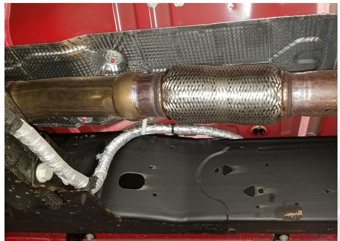
Detail 3: OEM ball clamped connection point.