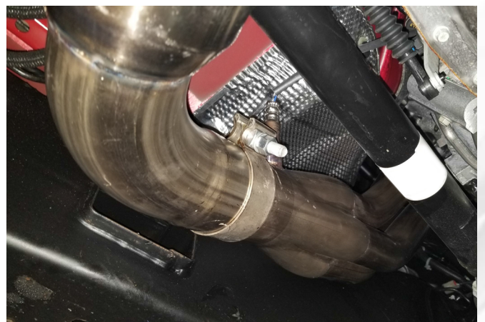
Detail 18: Driver side header - lead pipe connection.