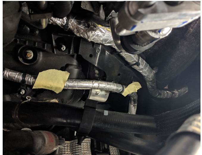
Detail 15: Wire harness to move. Locations for unlooming marked with tape.

23. Check that all components have been reinstalled.