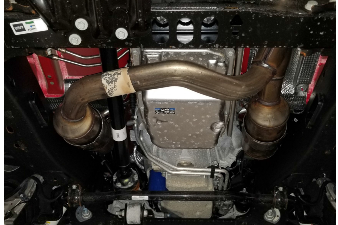
Detail 1: OEM manifolds and leads.