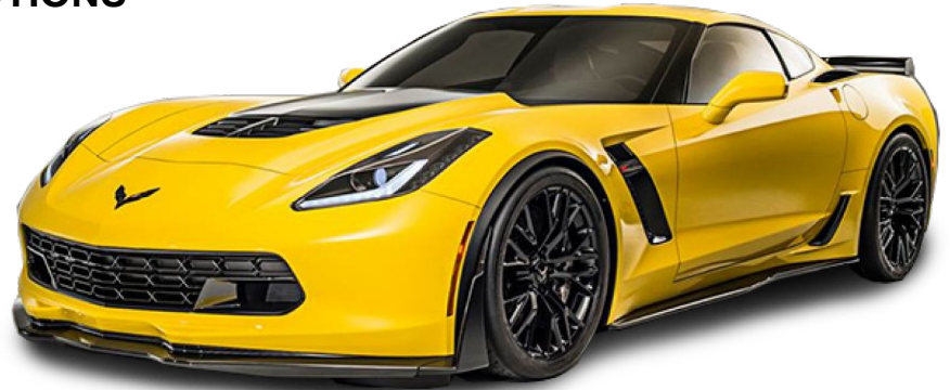
2014+ C7 Corvette (C720R, C72CAT, C71880R, C7188CAT, C7175STP0R, C7175STP0R)

Thanks for purchasing a Stainless Works Header system for your 2014+ C7 Corvette. Our team has worked to ensure that this product is the premium in performance, quality, and fitment. We are proud to say that this system will unleash the true character of your vehicle. We encourage you to read through the following steps, and check the included Bill of Materials before beginning. Please follow these steps to ensure that your installation goes as planned.