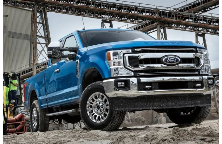
2020+ F250 7.3L (FT220CBL/R)

Thanks for purchasing a Stainless Works catback exhaust system for your 2020+ Ford F250/350 7.3L. Our team has worked to ensure that this product is the premium in performance, quality, and fitment. We are proud to say that this system will unleash the true character of your vehicle. We encourage you to read through the following steps, and check the included Bill of Materials before beginning. Please follow these steps to ensure that your installation goes as planned.