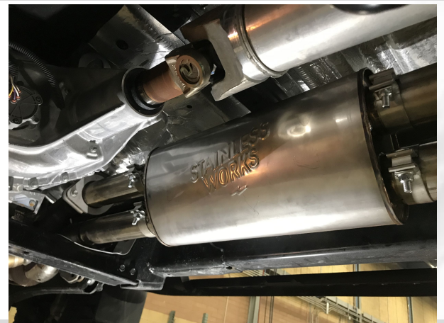
Detail 11: Inlet connection and Mid-muffler installed