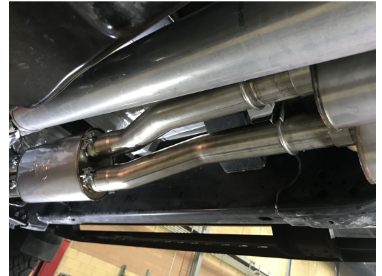
Detail 13: Inlet pipes to mufflers

19. After double checking for clearance and making sure all lines, wires and hoses are secured, drive the truck for 10-20 miles and re-check all clamps and clearances. Your system may be tack welded at the joints/ clamps to reduce shifting of the system during heating and cooling cycles. Make certain to disconnect the battery before performing any welding.