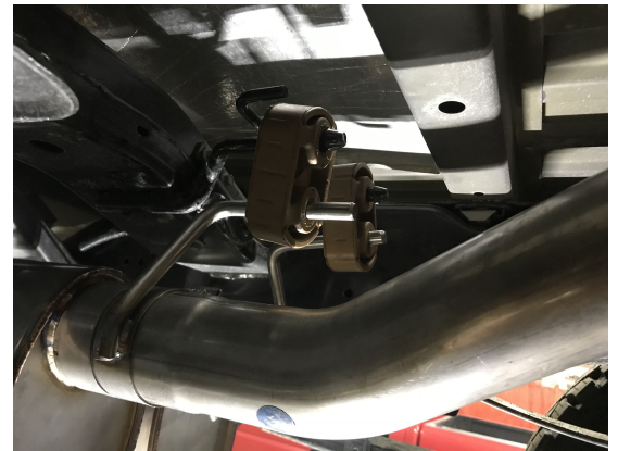
Detail 15: Muffler to tailpipe connection