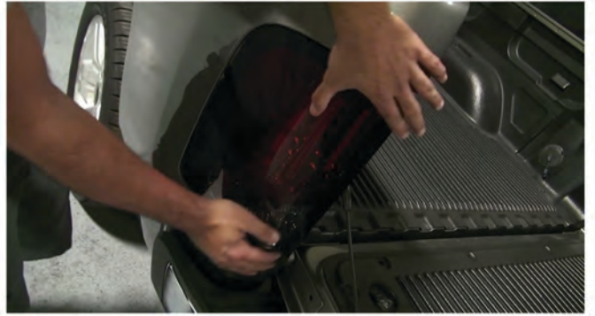
6) Seat the SPYDER tail light.