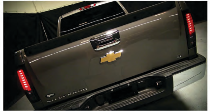
8) Enjoy your SPYDER LED tail lights.