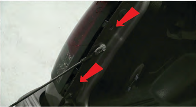
7) Reinstall the two phillips head screws that secure the tail lights.