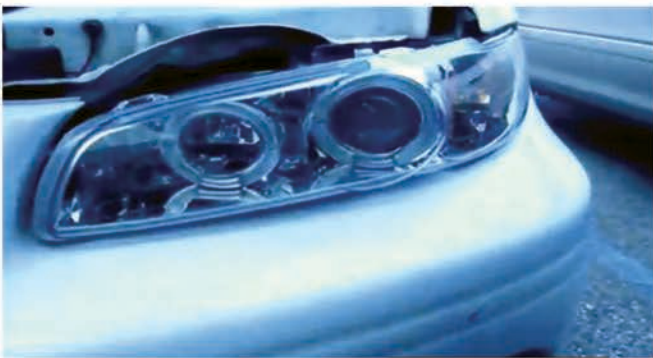
9) Enjoy your new SPYDER headlights.