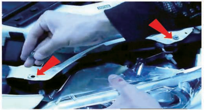
8) Reinstall two 10mm Bolts to secure headlight.