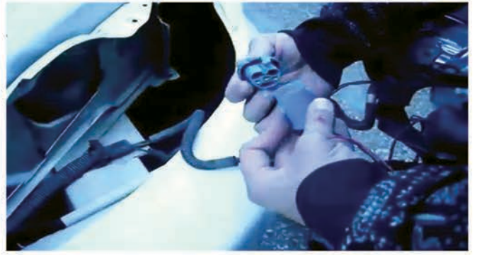
6) Connect the SPYDER headlight harness to the OEM headlight socket connector.