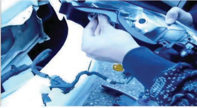
5) Locate SPYDER headlight. Install turn signal bulb and side marker bulb sockets.