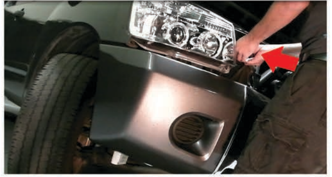
12) Connect SPYDER headlight wiring harness to the truck's wiring harness.