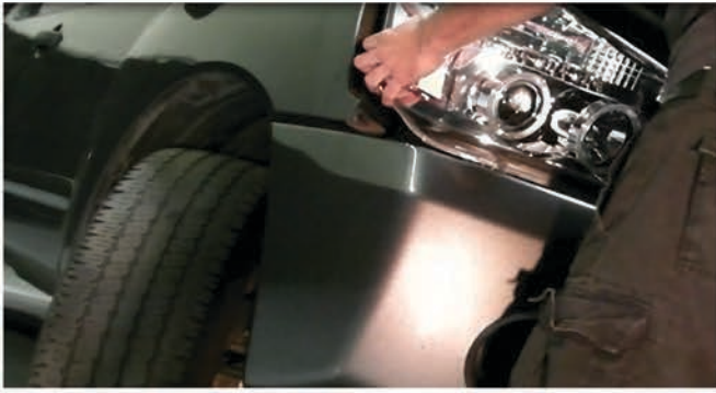
11) Seat the SPYDER headlight.