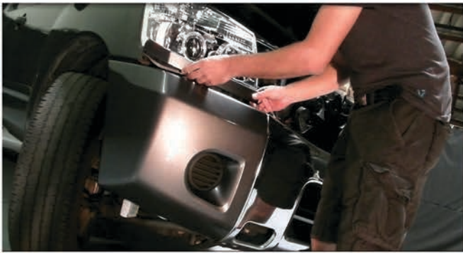
13) Reinstall Headlight Trim Panel by pushing it gently into place, being sure to install it fully so that the trim panel is secure.