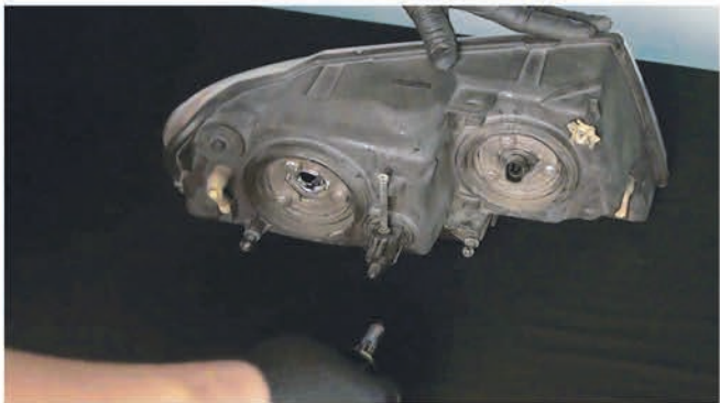
7) Remove the low beam bulb from the OEM headlight. Never touch exposed bulbs with bare hands.