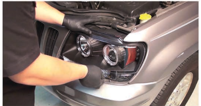
12) Seat the Spyder headlight.