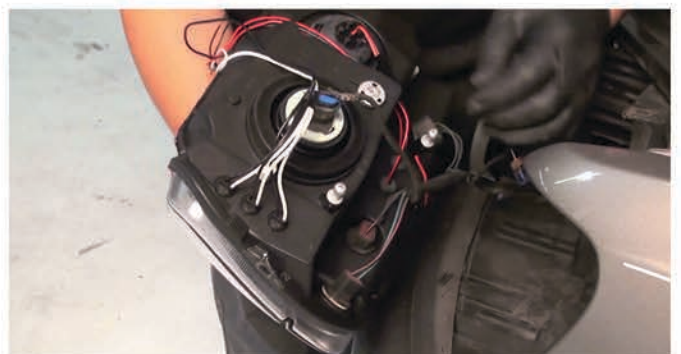
10) Reconnect the low beam harness.