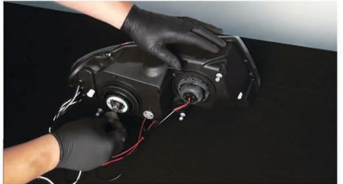
8) Install the low beam bulb into the Spyder headlight. Be sure to check the bulb gasket and replace it if worn. Your Spyder headlight is now ready to install.