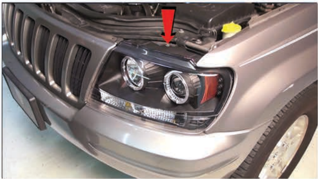
13) Reinstall the 7mm headlight retainer bolt.