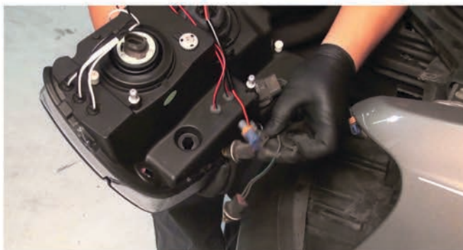
9) Reinstall the sidemarker and turn signal bulb sockets into the Spyder headlight. Never touch exposed bulbs with bare hands.