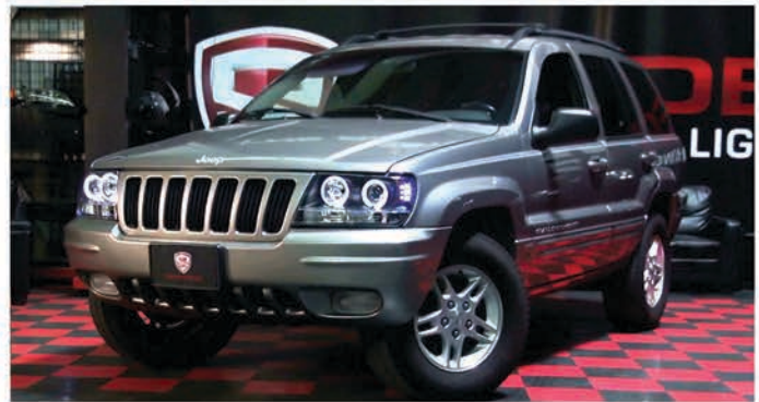
14) Close the hood and enjoy your new Spyder headlights!