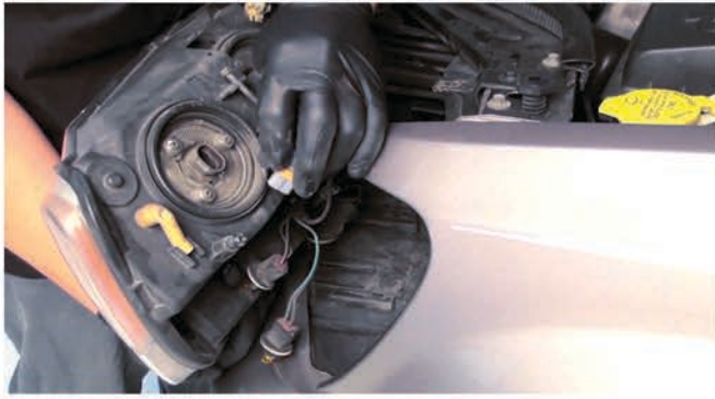
5) Disconnect the low beam harness.