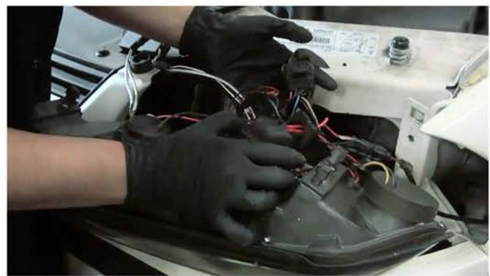
4) Disconnect the headlight wiring harness.

We offer direct replacement factory headlights, as well as a huge selection of custom headlights in your choice of styles and lighting options.