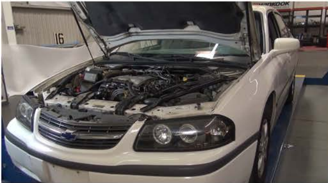
1) Open the hood.

If you are unfamiliar with the installation processes, professional installation is highly recommended.