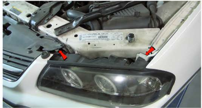
2) Remove [2x] plastic pull tabs securing the headlight.