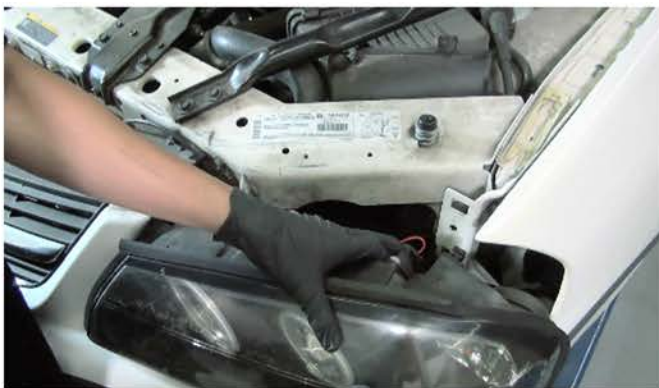
3) Unseat the headlight.