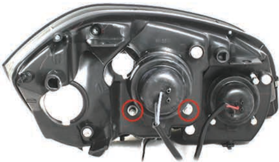
7) The beam adjusters are shown here and are 8mm. For information on wiring the halos, watch "How To Wire Halos" on the Spyder FAQs playlist on the Spyder Auto YouTube channel.