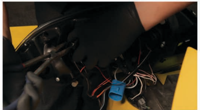
8) Reinstall the city light socket into the Spyder headlight.