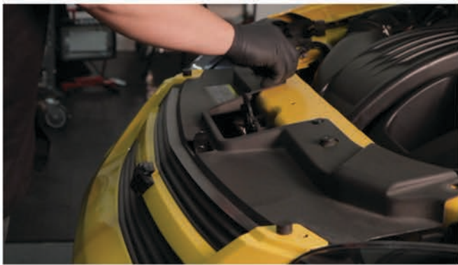
13) Reinstall [6x] plastic retainers to secure the fascia.