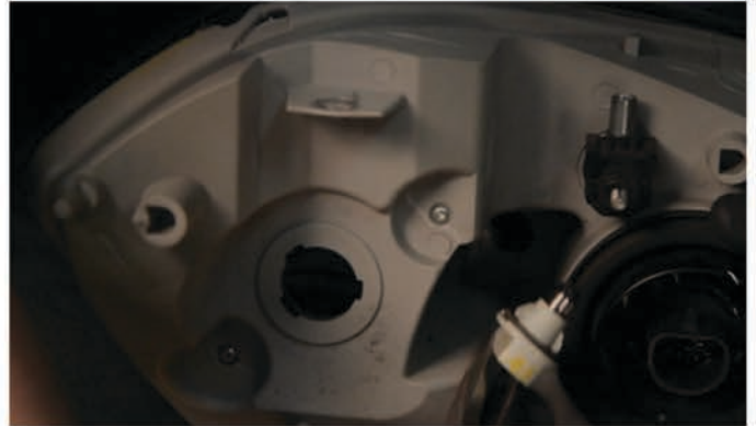
6) Remove the city light socket from the headlight.