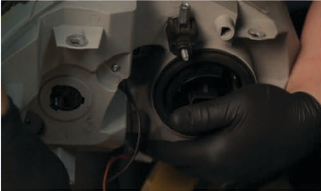
5) Remove the turn signal socket from the headlight.