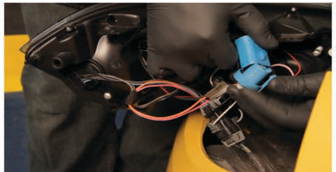
10) Reconnect the headlight wiring harness.