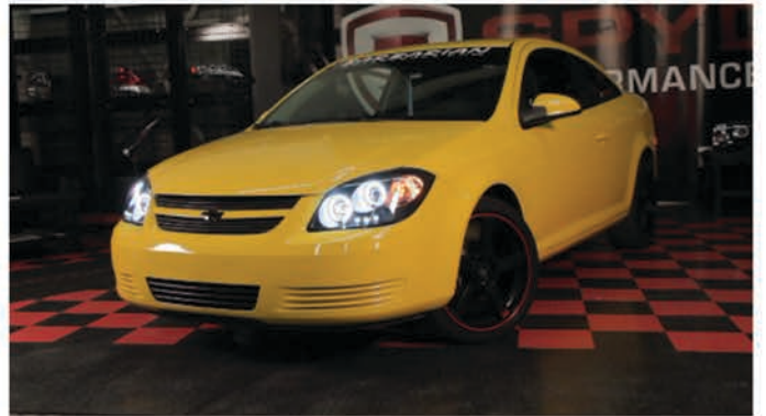
14) Close the hood and enjoy your new Spyder projector headlights.