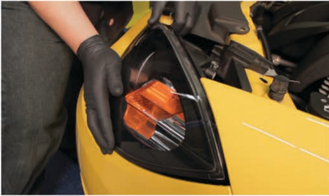
11) Seat the Spyder headlight.