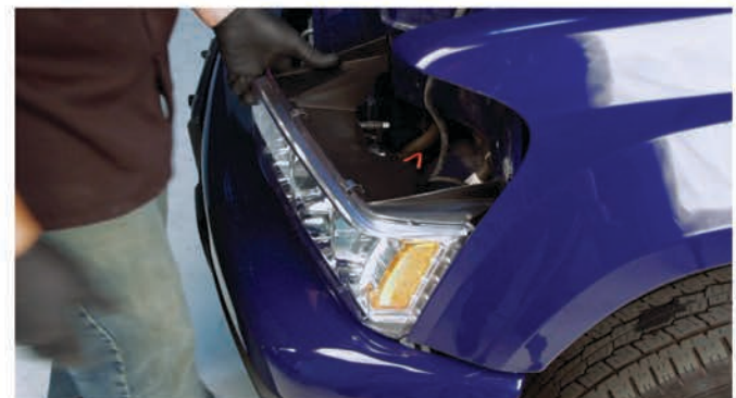
10) Seat the Spyder headlight.