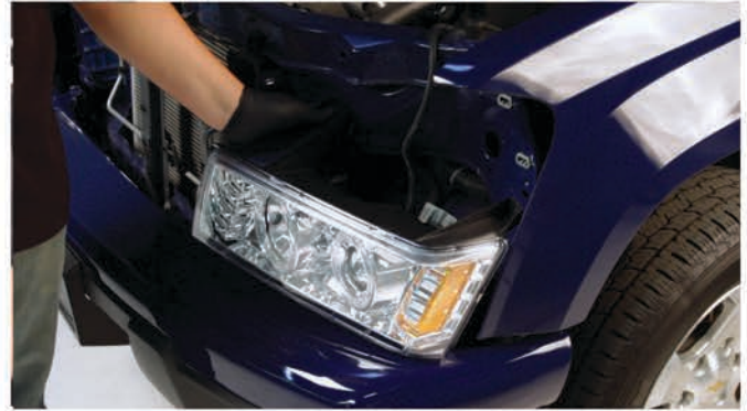
8) Locate your Spyder headlight.