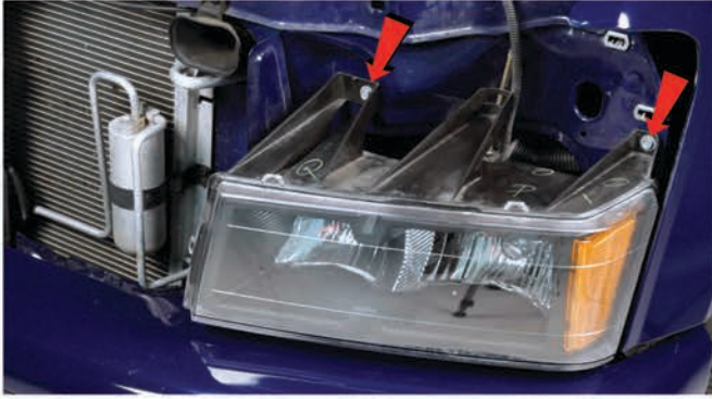
5) Remove [2x] 10mm bolts securing the headlight.