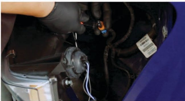
9) Connect the high beam and low beam harnesses to your Spyder headlight.