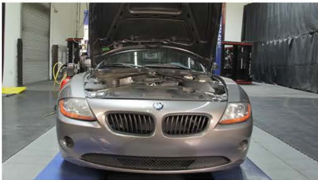
1) Open the hood.