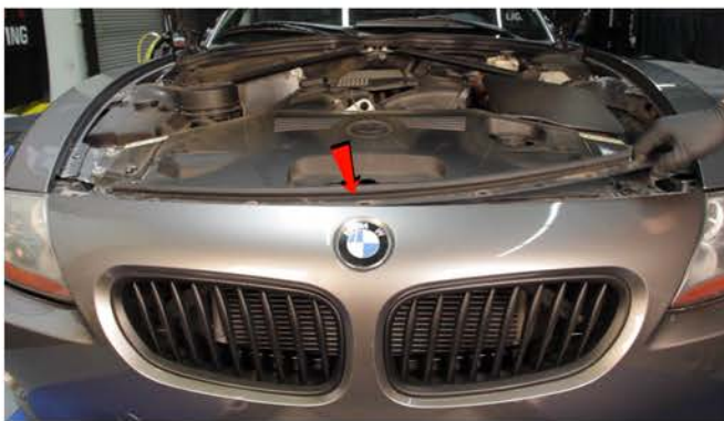
3) Remove the hood weatherstrip bracket.