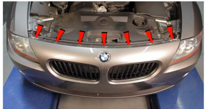
2) Remove [7x] T-30 Torx Bolts securing the fascia along the edge.