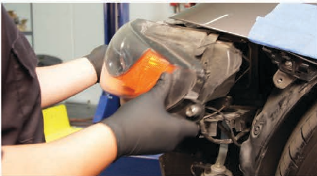
9) Unseat the OEM head light.