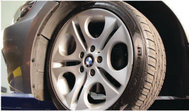
19) Reinstall [4x] plastic retainers securing the fascia at the wheel well.