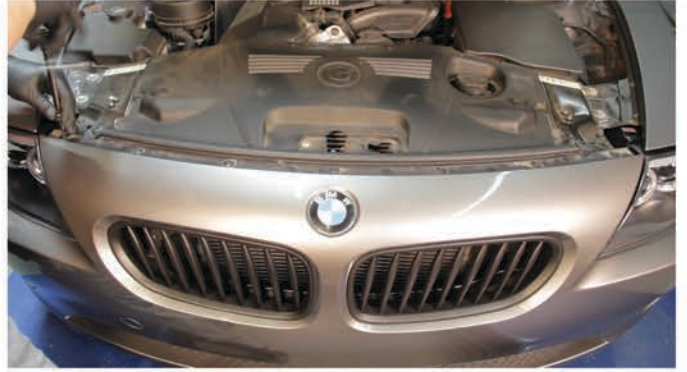
18) Reinstall [7x] T-30 Torx bolts to secure the hood weatherstrip bracket.