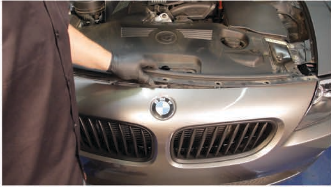
17) Replace the hood weatherstrip bracket.