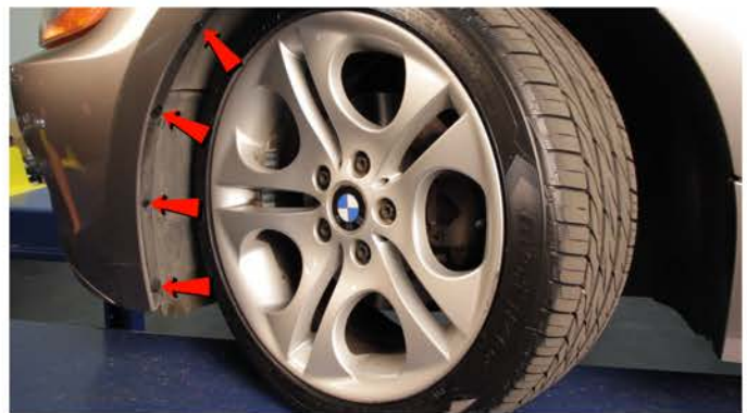
4) Remove the four plastic retainers securing the fascia at the wheel well using a panel popper.