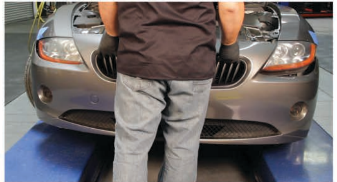
6) Unseat the front bumper fascia.