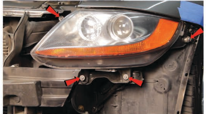
8) Remove [4x] T-25 Torx bolts securing the headlight to the body.