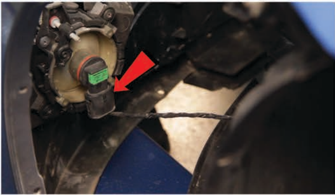
7) Disconnect the fog lamp harness.