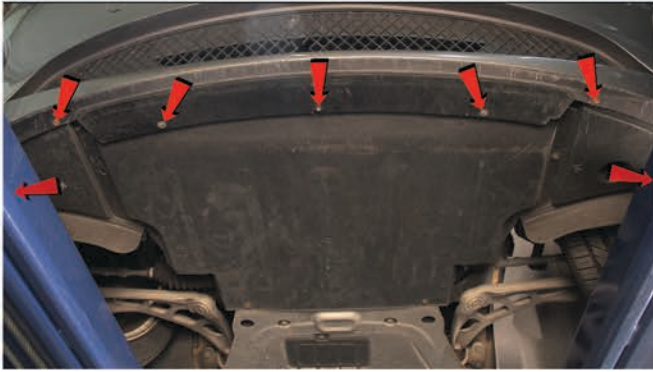
5) Remove [7x] 8mm bolts securing the fascia to the undertray from below.