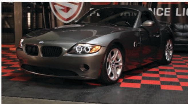
21) Close the hood and enjoy your new Spyder headlights!

We offer direct replacement factory headlights , as well as a huge selection of custom headlights in your choice of styles and lighting options.