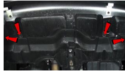
20. Reinstall (2x) 10mm bolts and (1x) plastic retainer on either corner of the lower bumper fascia.