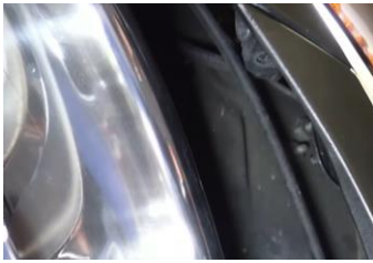
19. Reinstall (1x) 10mm bolts on either corner of the bumper fascia.