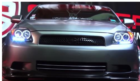
21. Turn on lights and confirm all functions are working properly. You have successfully completed the install of your new Spyder Headlights.