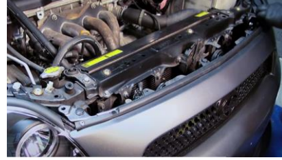
18. Reinstall (3x) plastic retainers. Note you will not use the 2 smaller retainers anymore.