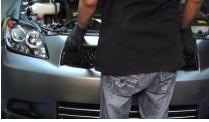
17. Seat bumper fascia.