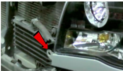
19. Reinstall headlight garnish and (1x) retaining clip.