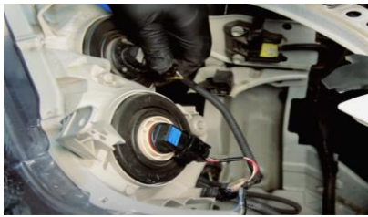
13. Disconnect low beam, high beam and side marker harnesses.