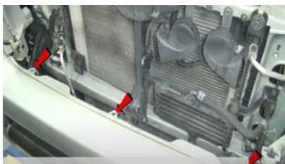
21. Reinstall (3x) plastic retainers.