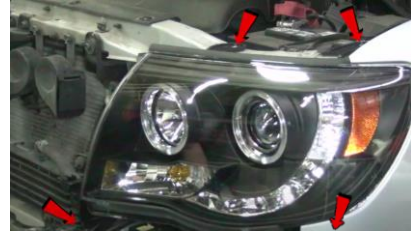
18. Reinstall (4x) 10mm bolts securing the Spyder headlight.