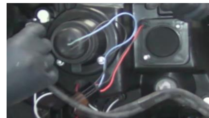
16. Connect headlight, side marker and turn signal harness onto Spyder headlight.