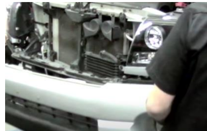
20. Seat front bumper fascia. (Reconnect fogs light harnesses)