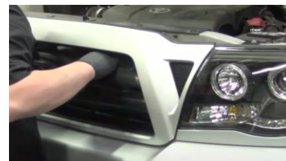
22. Seat grill and reinstall (2x) plastic retainers and (2x) Philips screws securing the grill.