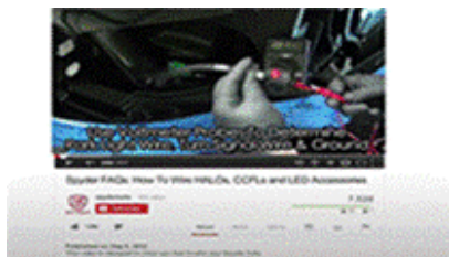
15. For info on how to wire halos please refer to the Spyder FAQ playlist on the Spyder Auto YouTube channel.