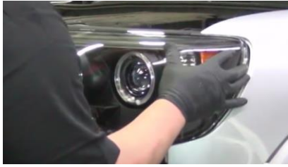
17. Seat Spyder headlight.