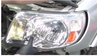
11. Unseat the headlight.