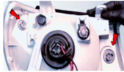
14. Remove turn signal socket and side marker socket from OEM headlight and install onto Spyder headlight.