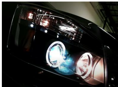
19. Turn on lights and confirm all functions are working properly. You have successfully completed the install of your new Spyder Headlights.