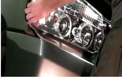
17. Seat Spyder headlight.