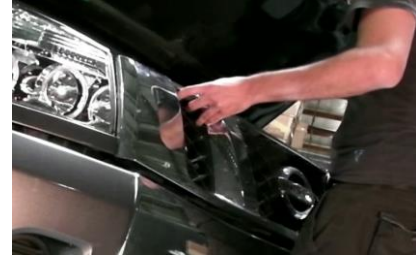
18. Reinstall grill and (8x) retaining clips.