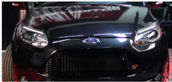
7. Turn on lights and confirm all functions are working properly. You have successfully completed the install of your new Spyder Headlights.