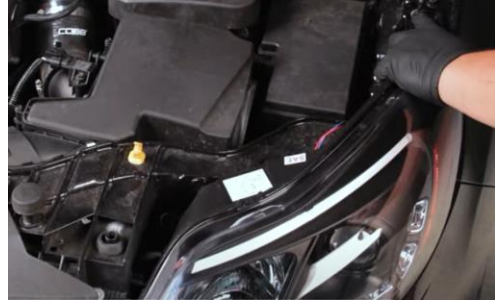
6. Reinstall (2x) T30 torx securing the headlight.