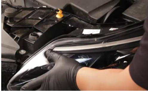
5. Seat Spyder headlight.