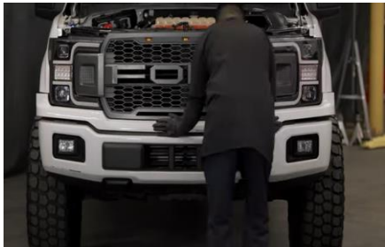
19. Reinstall bumper trim and (2x) 7mm bolts securing each side.