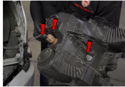
12. Disconnect (2x) headlight clips and remove turn signal socket.