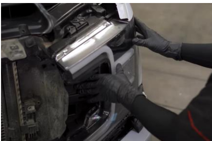
15. Seat Spyder headlight.