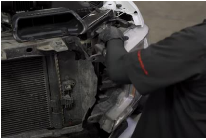
11. Unseat the headlight.