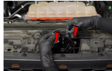
20. Reinstall (2x) sensor slips onto grill.