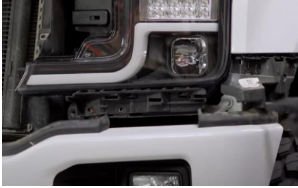
17. Reinstall (1x) 8mm and (3x) 10mm bolts securing the bottom of the Spyder headlight.