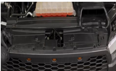
21. Reinstall radiator shroud and (14x) retaining slips.