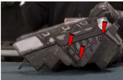
13. Remove (3x) T25 torx and transfer bracket to Spyder headlight.