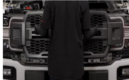
18. Reinstall grill securing it with (2x) lower 8mm bolts and (4x) upper 10mm bolts.