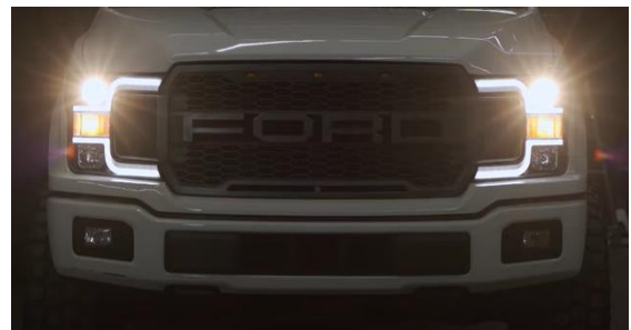
22. Turn on lights and confirm all functions are working properly. You have successfully completed the install of your new Spyder Headlights.