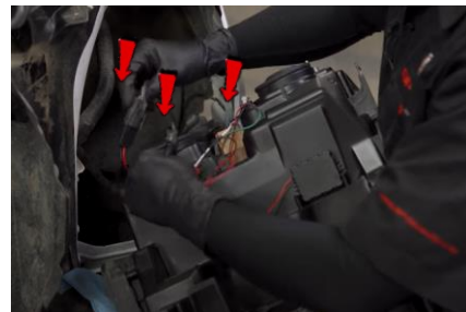
14. Connect (2x) headlight clips and install turn signal socket onto Spyder headlight.