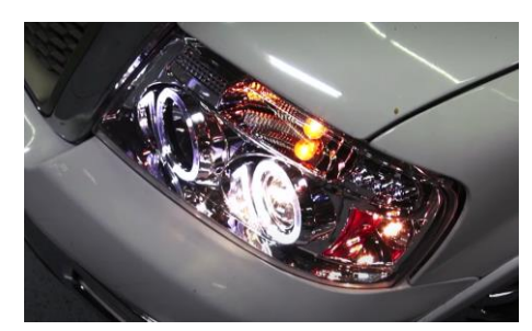
12.Turn on lights and confirm all functions are working properly. You have successfully completed the install of your new Spyder Headlights.

11. Reseat weather strip and install retainer.