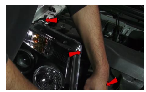
10. Reinstall (3x) 10mm bolts.