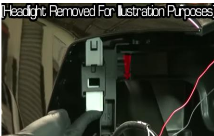
15. Lock retainer slider through the access panel behind the headlight. Close access panel when done.