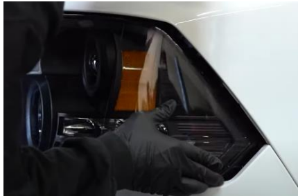
13. Seat Spyder headlight.