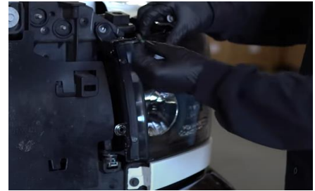
14. Reinstall (2x) 10mm bolts securing the Spyder headlight.