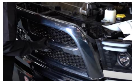
16. Seat grill and reinstall (4x) 10mm bolts.