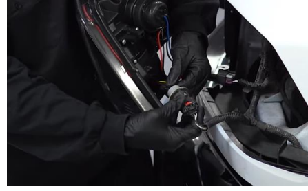
12. Install brake socket insert. (Align black wire from socket to black wire of socket insert). Install bulb socket onto Spyder headlight