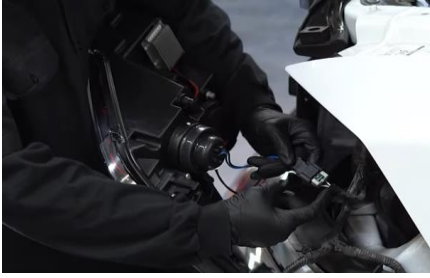
11. Connect Spyder headlight harness.