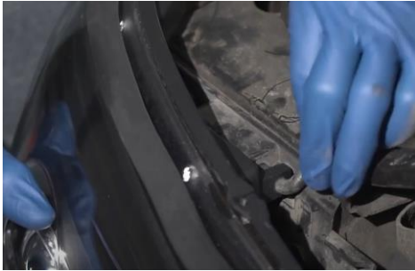
11. Reinstall (2x) headlight pins.