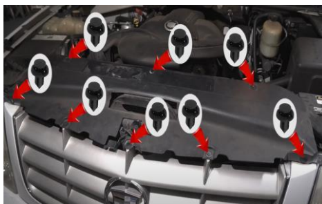
15. Reinstall (8x) plastic retainers.