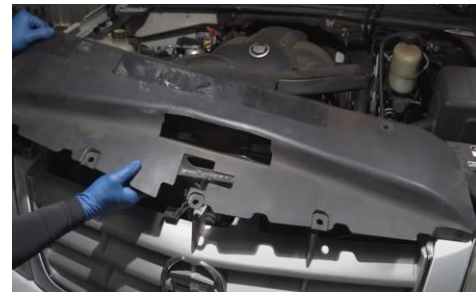
14. Seat radiator support cover.