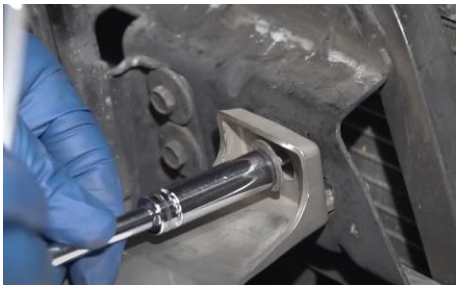
13. Reinstall (1x) 10mm bolt securing the grill.