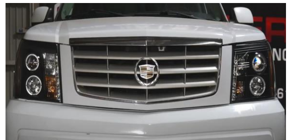
16. Turn on lights and confirm all functions are working properly. You have successfully completed the install of your new Spyder Headlights.