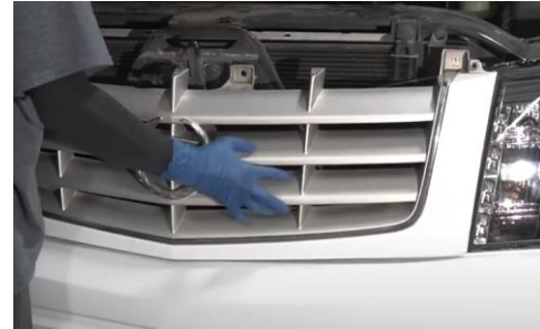
12. Reinstall grill and clip in (2x) grill retainer clips.