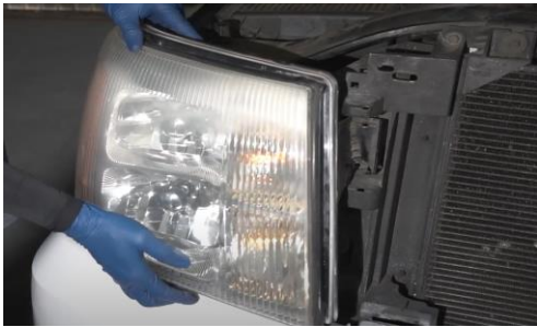
7. Unseat the headlight.