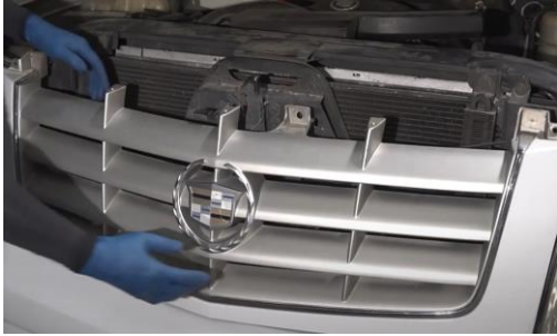
5. Unseat the grill.