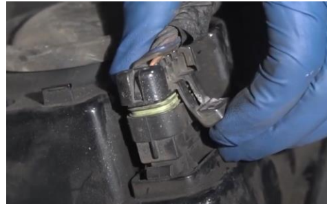
8. Disconnect headlight harness.