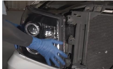
10. Seat Spyder headlight.