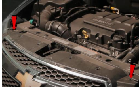
16. Reinstall (2x) 10mm bolts.