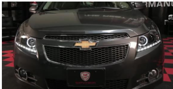
19. Turn on lights and confirm all functions are working properly. You have successfully completed the install of your new Spyder Headlights.