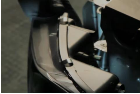
11. Seat Spyder headlight.