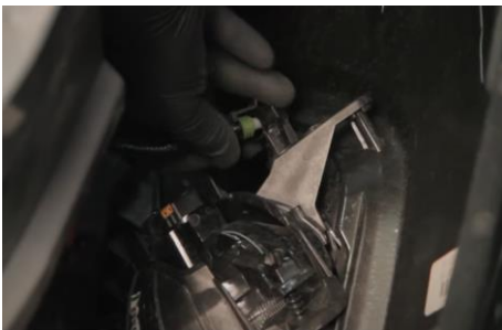
13. Reconnect Fog light and turn signal harness on bumper fascia.