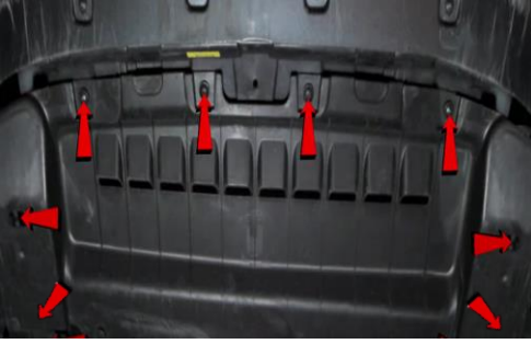
17. Reinstall (8x) T15 torx.