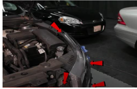
12. Reinstall (4x) 10mm bolts securing the headlight.