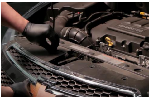
15. Reinstall (4x) plastic retainer securing the front bumper fascia.