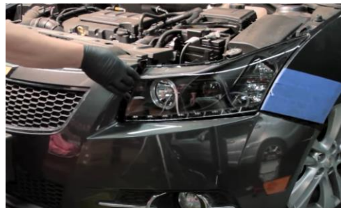
14. Seat the bumper fascia.