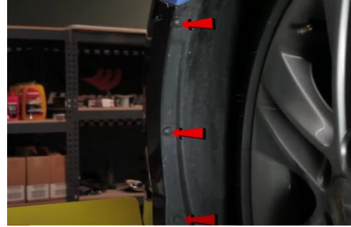
18. Reinstall (3x) T15 torx screws securing fender liner.