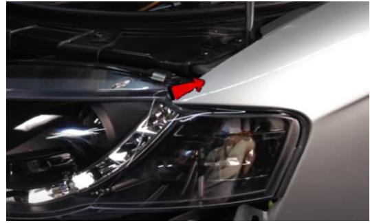
18. Tighten outside (1x) T30 torx screw.