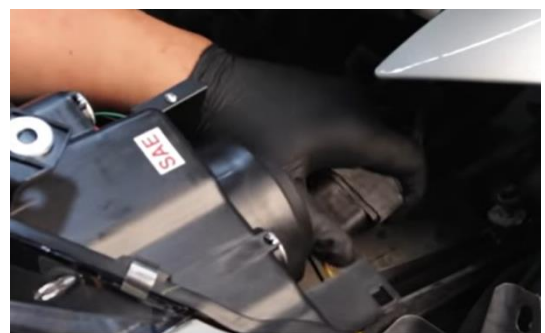
14. Connect Spyder headlight harness.