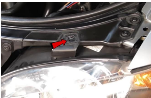
9. Remove (1x) T30 torx screw.