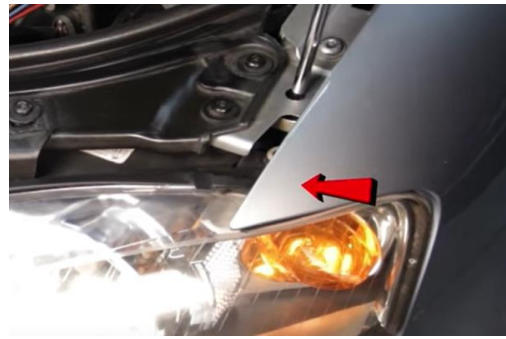
8. Loosen (1x) T30 torx hidden under core support.