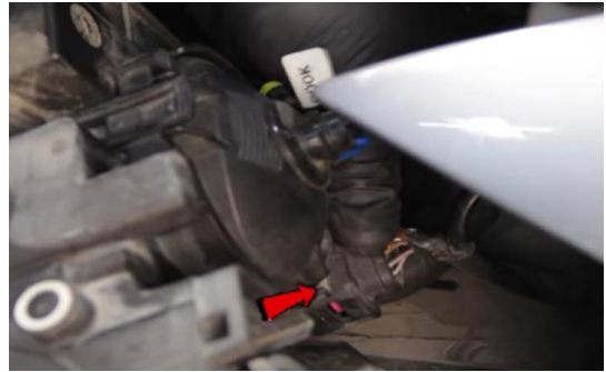
12. Disconnect headlight harness.