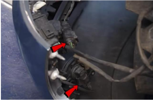
7. Disconnect fog light and side marker harness.