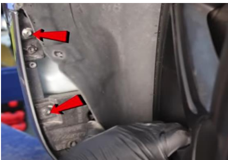
3. Remove (2x) T25 torx screws.