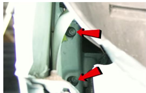
4. Remove (2x) 10mm nuts.