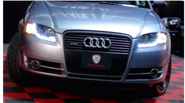
26. Turn on lights and confirm all functions are working properly. You have successfully completed the install of your new Spyder Headlights.