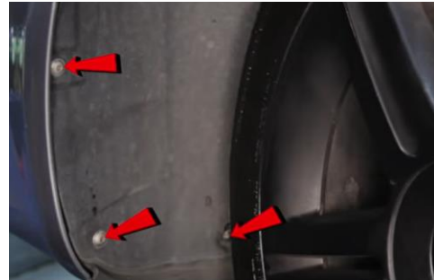
2. In wheel well remove (3x) T25 torx screws.