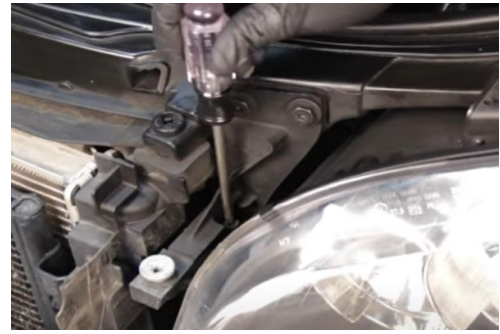
10. Loosen (1x) T30 torx screw.