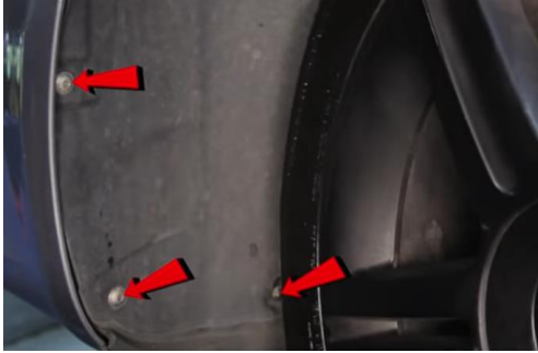
23. Reinstall (3x) T25 torx screws.