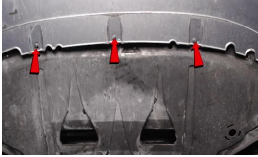
5. Under front bumper remove (3x) T25 torx screws.