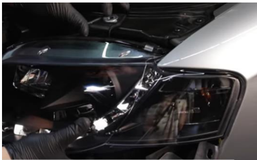
15. Seat Spyder headlight.