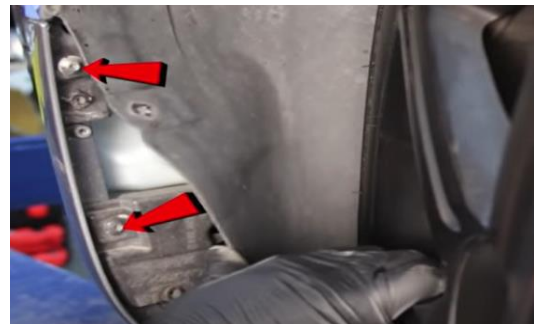
22. Reinstall (2x) T25 torx screws.