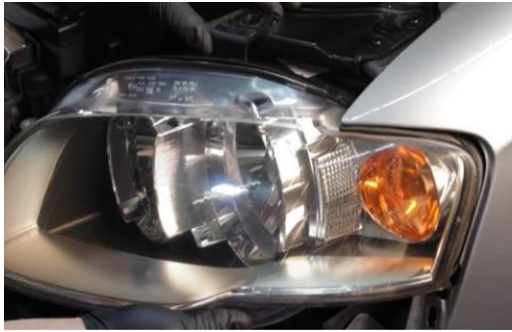
11. Unseat headlight.