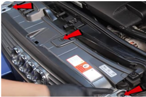
25. Reinstall (3x) T30 torx screws.