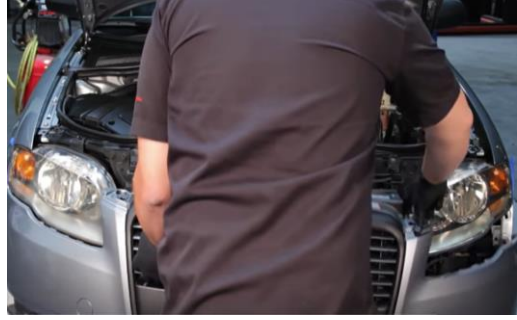
6. Remove bumper fascia.