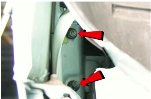
21. Reinstall (2x) 10mm nuts.