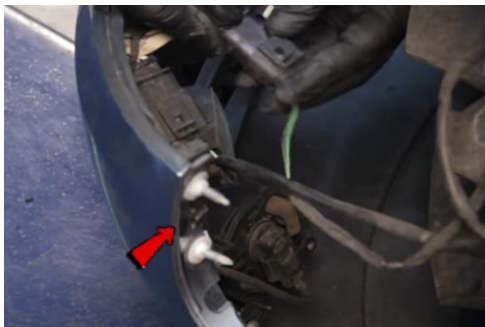
19. Reconnect fog light and side marker harness.