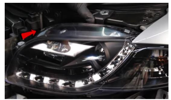
16. Tighten inner (1x) T30 torx screw.