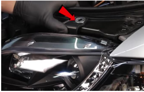
17. Locate included washer and place it below headlight bracket and install (1x) T30 screw.