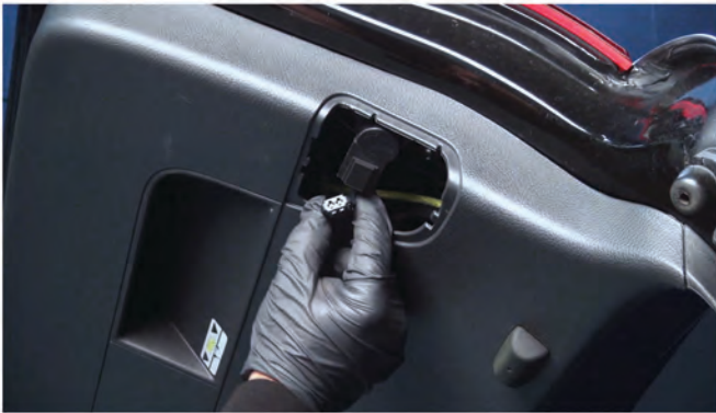
13) Disconnect the inner tail light wiring harness.