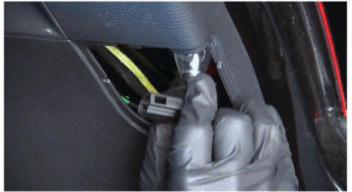
14) Remove the reverse bulb socket for access. Never touch exposed bulbs with bare hands.