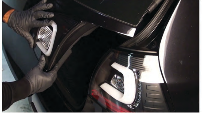
18) Seat the Spyder headlight.