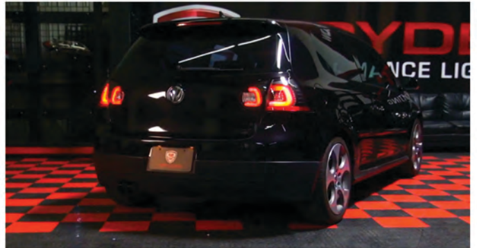
22) Close the hatch and enjoy your new Spyder light tube LED tail lights.