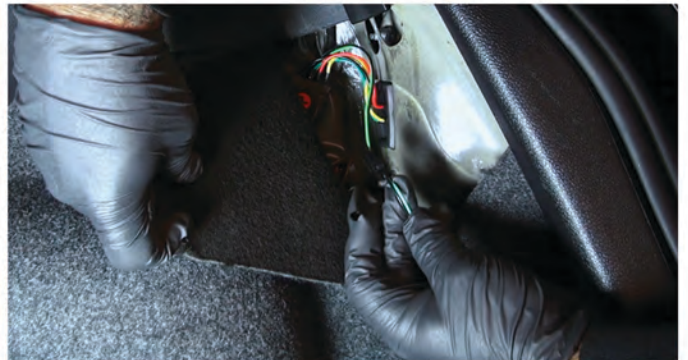
10) Connect the green and black outer-to-inner tail harness to the main outer tail light harness.