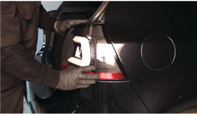
7) Seat the Spyder outer tail light.