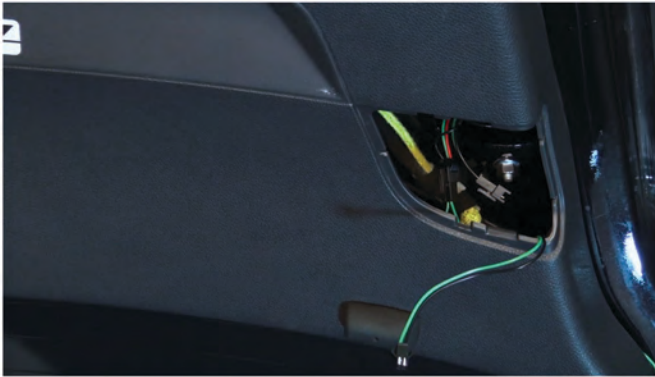
19) Reinstall [2x] 10mm nuts to secure the inner tail light.