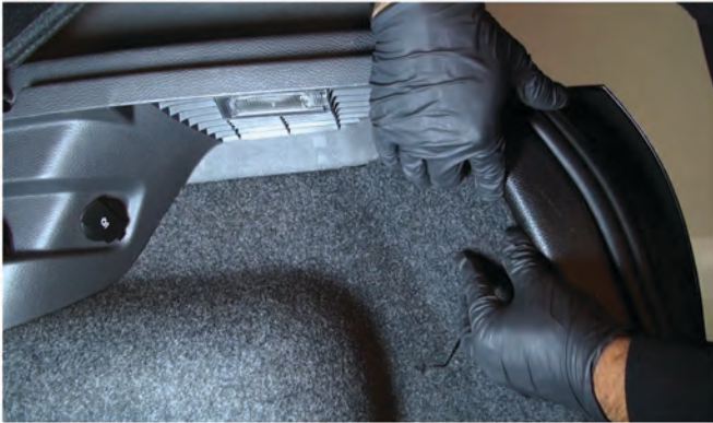
11) Tuck the harnesses away, then close the access flap.