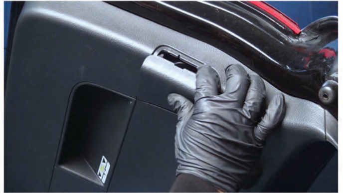
12) Remove the inner tail light access cover.