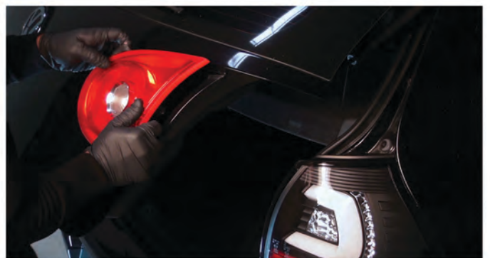
16) Unseat and remove the inner tail light.