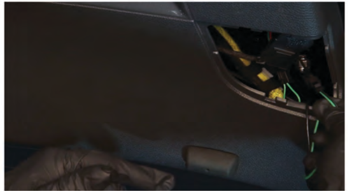
20) Reconnect the inner tail light harness. Then connect the green-and-black outer-to-inner tail light harness to the Spyder inner tail light, then tuck the harness away behind the panel.