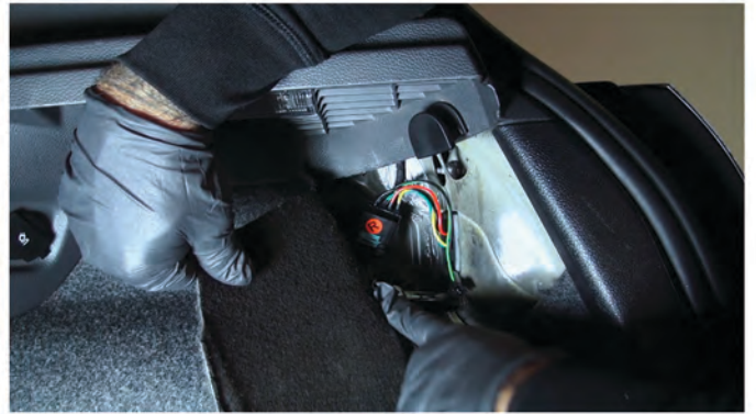
8) Reinstall [2x] 10mm nuts to secure the outer tail light to the body.