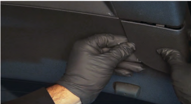
21) Close the inner tail light access panel.