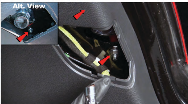
15) Remove [2x] 10mm nuts securing the inner tail light to the body.