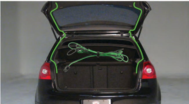
9) Route the green and black outer to inner tail harness included with your tail light through the body along the path marked here. The green and black outer-to-inner harness MUST be connected for inner LEDs to light up.