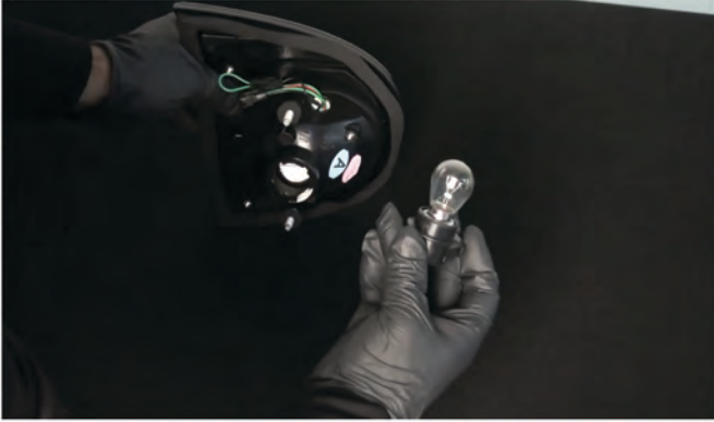
17) Transfer the reverse bulb socket from the OEM inner tail light to the Spyder tail light.