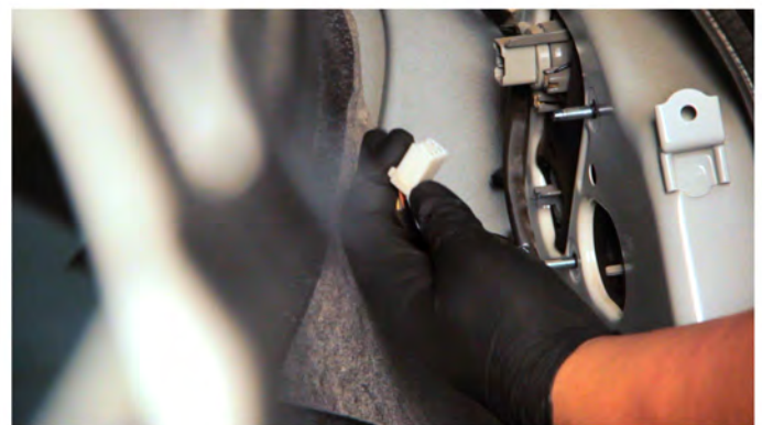
4) Disconnect the tail light harness.