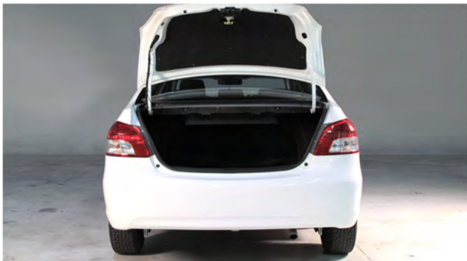
1) Open the trunk.

If you are unfamiliar with the installation processes, professional installation is highly recommended.