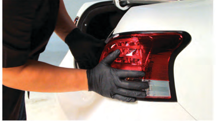
6) Locate the Spyder tail light and feed the wiring harness into the body, then seat the spyder tail light.