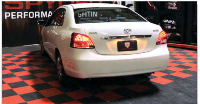
10) Close the trunk and enjoy your new Spyder LED Tail lights.