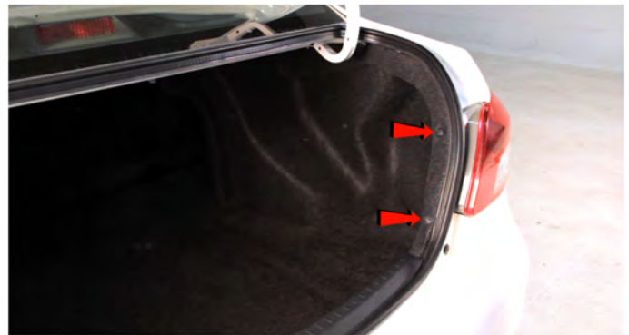
2) Remove [2x] plastic retainers securing the trunk liner.