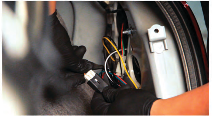
8) Connect the tail light harness.