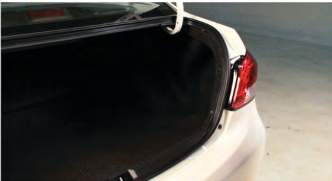
9) Replace the trunk liner, then reinstall [2x] plastic retainers to secure the liner.