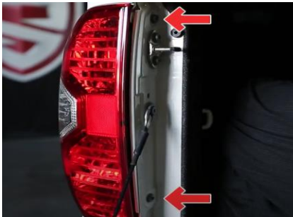
1. Remove (2x) T30 torx screws.