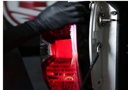
2. Unseat tail light.