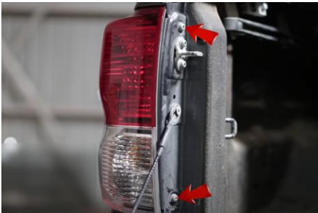
1. Remove (2x) T30 torx screws.