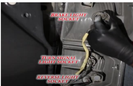
3. Remove (3x) bulb sockets.