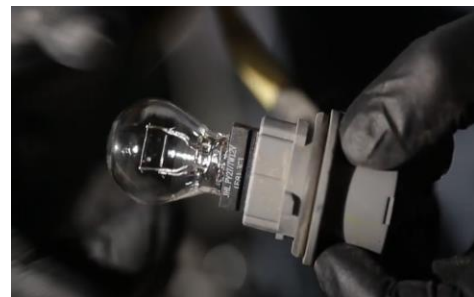
4. Remove bulb from brake socket.