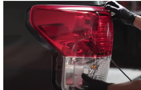
2. Unseat tail light.