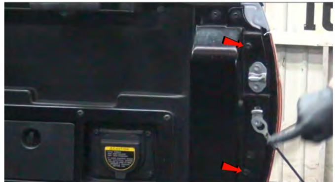
2) Remove the [2x] 10mm bolts securing the tail light.