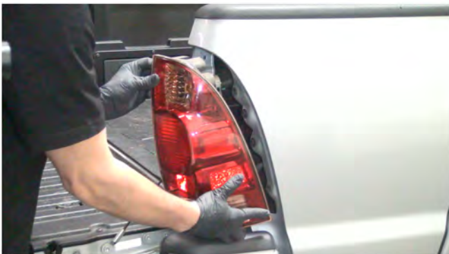
3) Unseat the OEM tail light.