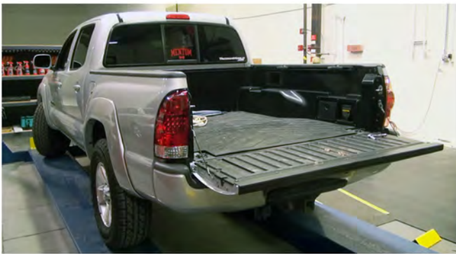
1) Open the tailgate.

If you are unfamiliar with the installation processes, professional installation is highly recommended.