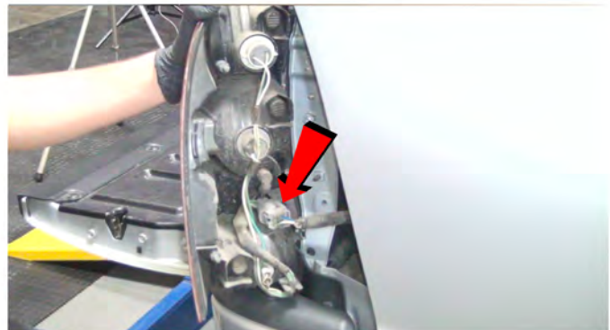
4) Disconnect the wiring harness.