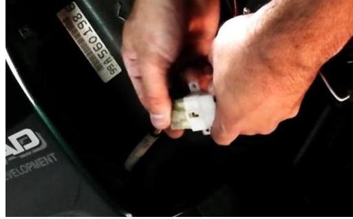
6. Connect Spyder tail light harness.