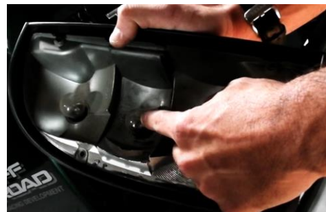
4. Separate factory tail light and remove reverse light bulb. (Never touch bulbs with bare hands)