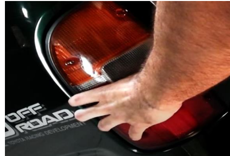
2. Unseat tail light.