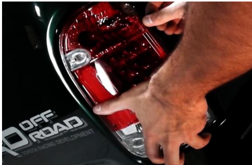
7. Seat Spyder tail light.