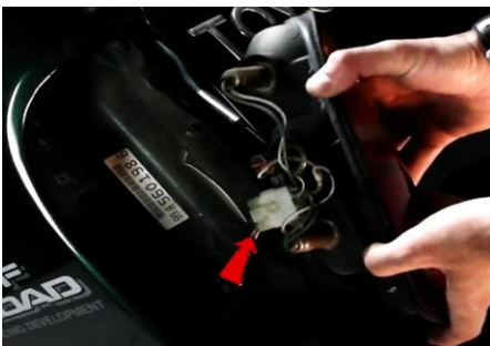
3. Disconnect wire harness.