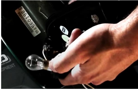
5. Transfer bulb to Spyder tail light reverse light socket.