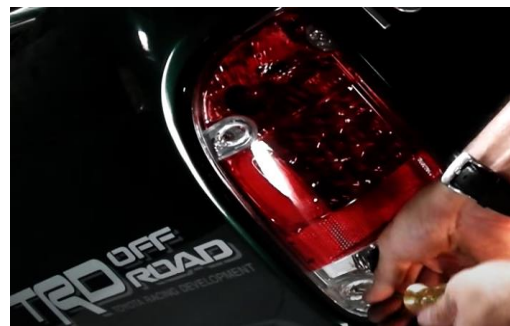
8. Reinstall (4x) phillips screws.