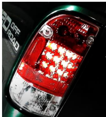
9. Turn on lights and confirm all functions are working properly. You have successfully completed the install of your new Spyder LED tail lights.