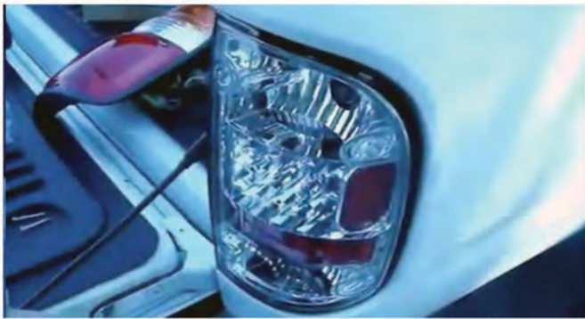
7) Enjoy your new SPYDER LED tail lights.