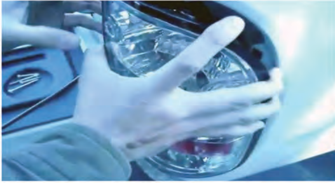
5) Seat the SPYDER tail light.