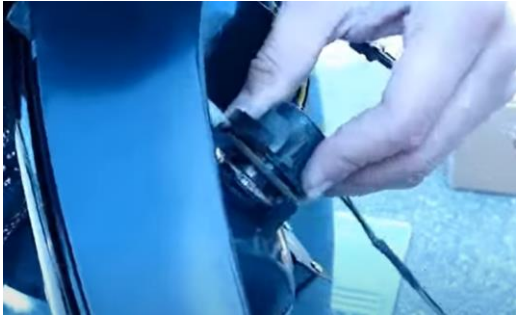
5. Install reverse socket with bulb. (Never touch bulbs with bare hands)