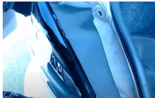
8. Seat Spyder tail light.