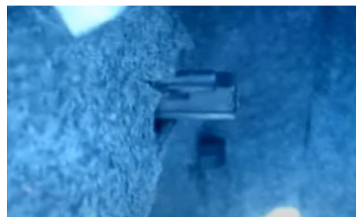
10. Seat trunk liner and install (2x) plastic nuts.