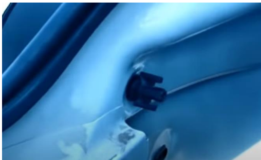
9. Reinstall (1x) plastic nut.