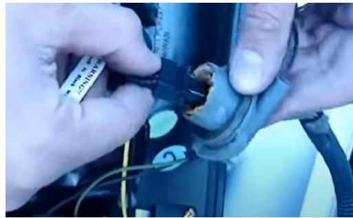
6. Remove brake bulb and insert brake socket insert. (Align black wire of socket insert to black wire of socket)