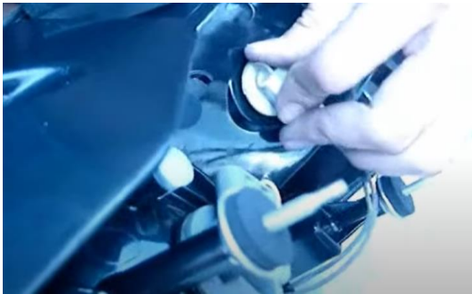
7. Install brake and side marker sockets.