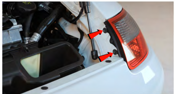
2) Remove the [2x] T-25 Torx screws securing the tail light.