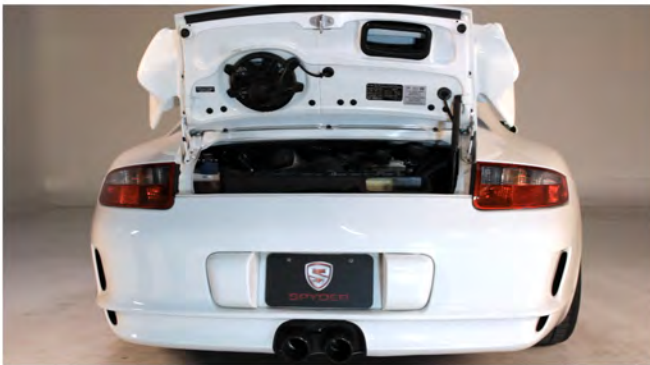
1) Open the bonnet.

If you are unfamiliar with the installation processes, professional installation is highly recommended.