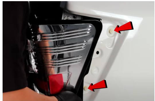
8. Align side tabs and seat Spyder tail light.