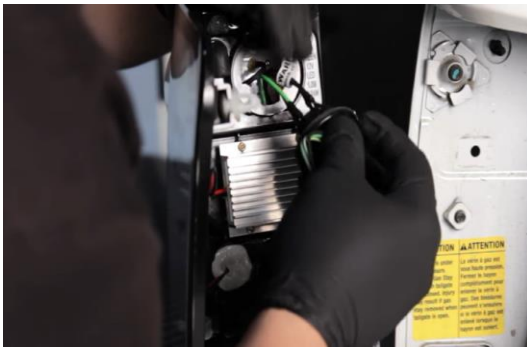
7. Install Spyder upper bulb insert into bulb socket. (Align black wire of socket insert to black wire of socket) Install socket.