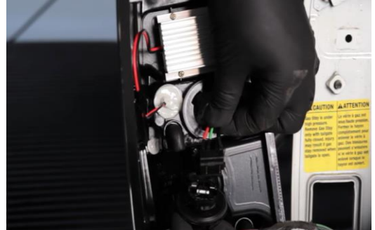
6. Install Spyder lower bulb insert into bulb socket. (Align black wire of socket insert to black wire of socket) Install socket.