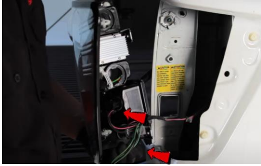
5. Install lower two bulb sockets into Spyder tail light.