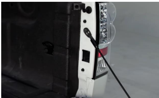
9. Reinstall (2x) 10mm bolts.