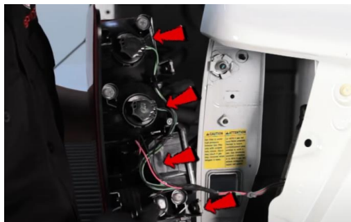
3. Remove (4x) tail light sockets. (Never touch bulbs with bare hands)