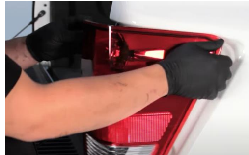
2. Unseat tail light.