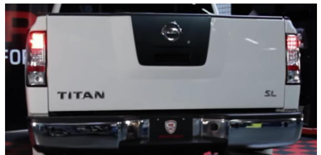
10. Turn on lights and confirm all functions are working properly. You have successfully completed the install of your new Spyder LED tail lights.