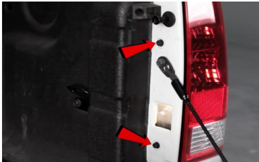
1. Remove (2x) 10mm bolts.