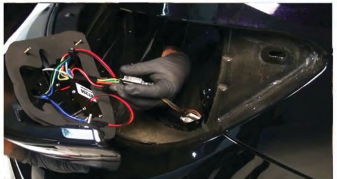
10) Connect the Spyder headlight to the wiring harness.