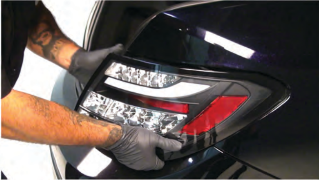
11) Seat the Spyder tail light.