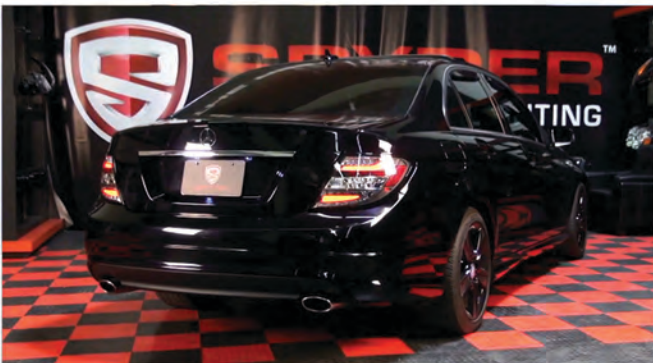
15) Close the trunk and enjoy your new Spyder LED tail lights.