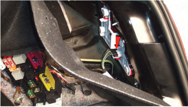
5) Disconnect the tail light wiring harness.