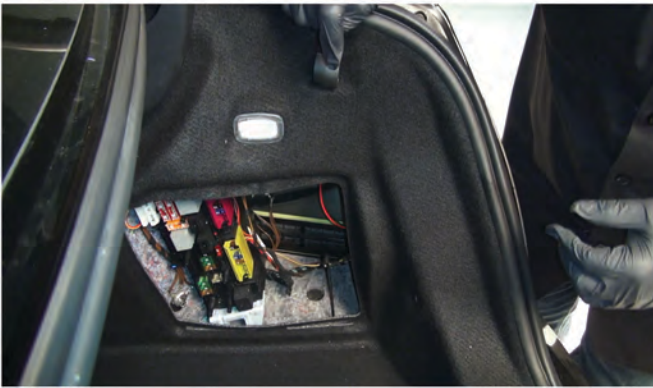
13) Replace the trunk liner, then reinstall the grocery hook and its retaining stake.