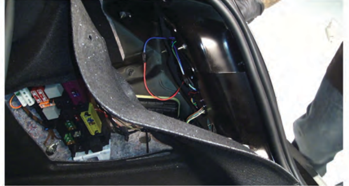
12) Reinstall [4x] 8mm bolts to mount the tail light.