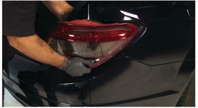
6) Unseat the OEM tail light.