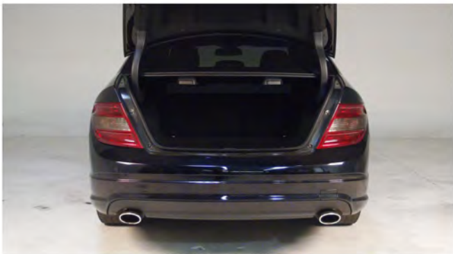
1) Open the trunk.

If you are unfamiliar with the installation processes, professional installation is highly recommended.