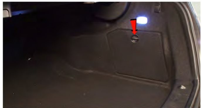
2) Unlock and open the tail light access panel.