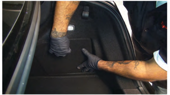
14) Reinstall the access panel, then lock the panel.