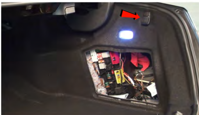
3) Use a panel popper to remove the retaining stake, then remove the grocery hook.