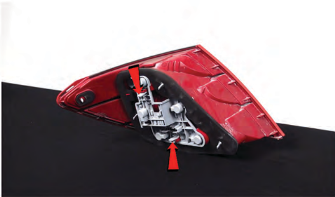
7) Take a look at the backside of the OEM tail light. Squeeze the tabs release and remove the bulb plate. Never touch exposed bulbs with bare hands.