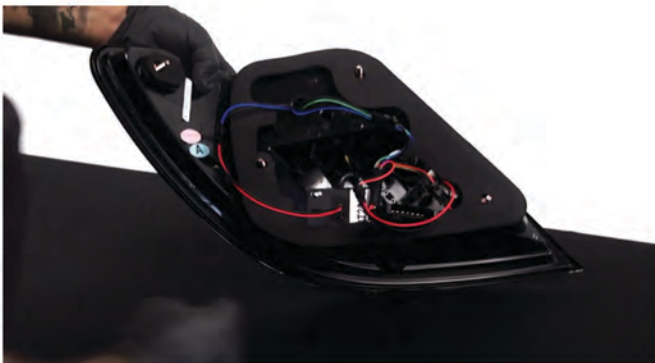
9) Be sure the gasket is properly mounted. Your Spyder tail light is now ready to install.