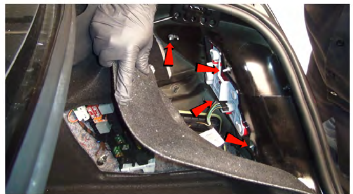
4) Peel back the trunk liner, then remove [4x] 8mm nuts that secure the tail light to the body.