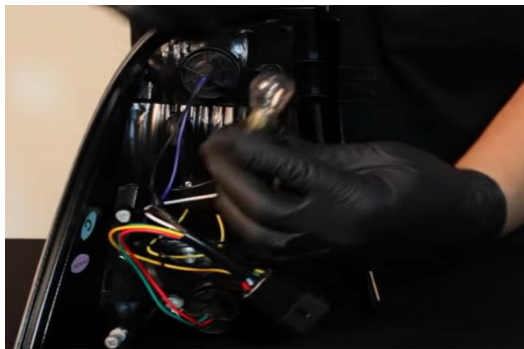
7. Install bulb into Spyder reverse socket and install socket into Spyder tail light.