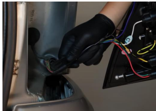
8. Connect Spyder tail light harness.