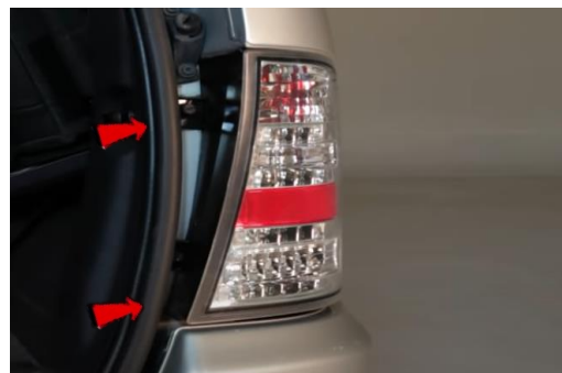
10. Reinstall (2x) 10mm nuts.