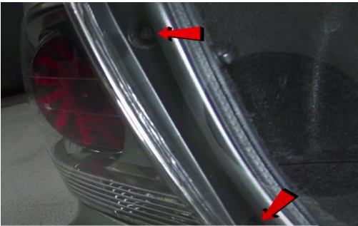
1. Remove (2x) 10mm bolts.