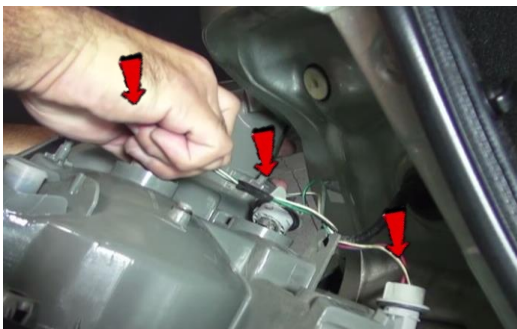
3. Remove (3x) bulb sockets.