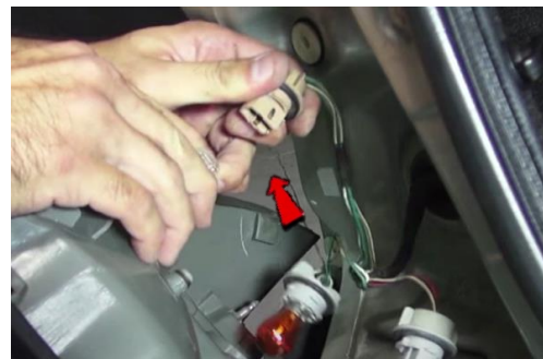
4. Remove brake bulb from socket. (Make not to touch bulb with bare hands)