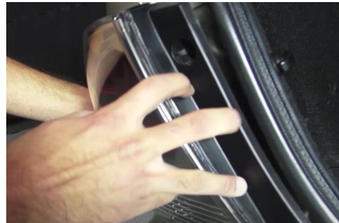
2. Unseat tail light.